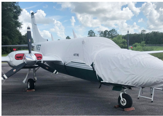
Piper Aerostar Canopy & Nose Covers, Engine Plugs