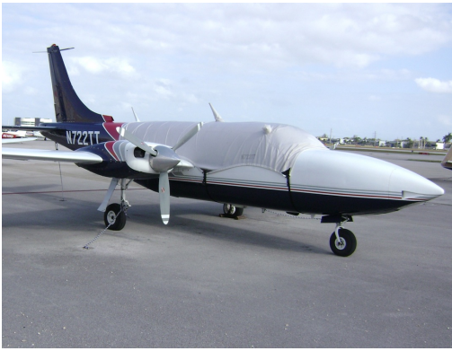
Aerostar Canopy Cover