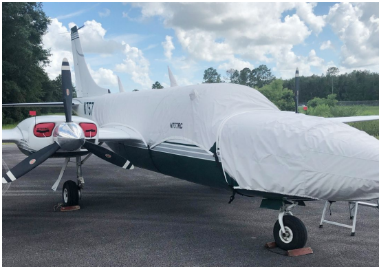
Piper Aerostar Canopy & Nose Covers, Engine Plugs