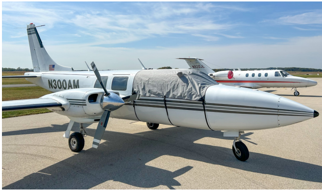
AEROSTAR 601P Travel Cover, Light Weight Travel Cockpit/Skylights Cover