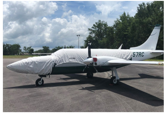
Piper Aerostar Canopy & Nose Covers, Engine Plugs