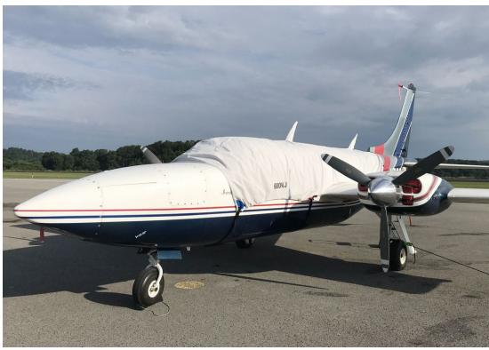
Smith Aerostar 600 Canopy Cover