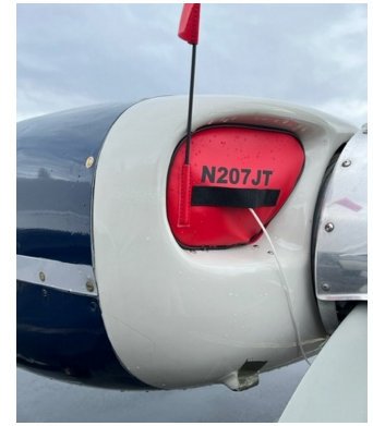
Piper Aerostar Engine Plugs