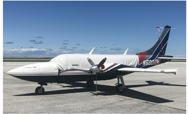
Smith Aerostar 600 Canopy Cover