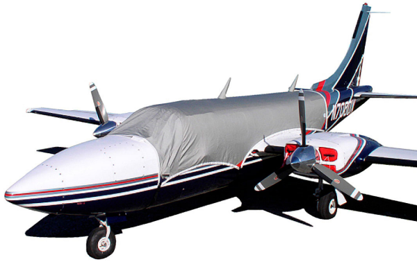
Aerostar Canopy Cover & Plugs