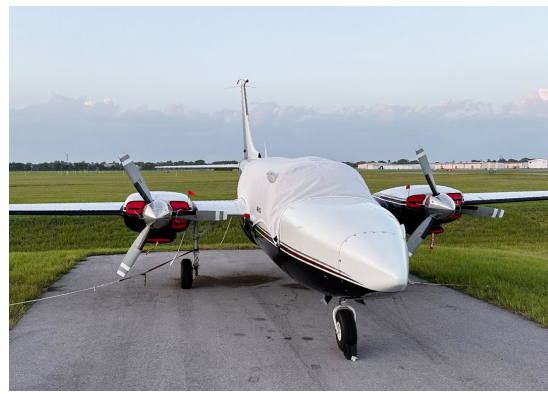
Piper PA-601 Aerostar Canopy Cover (Windows Only), Engine Plugs