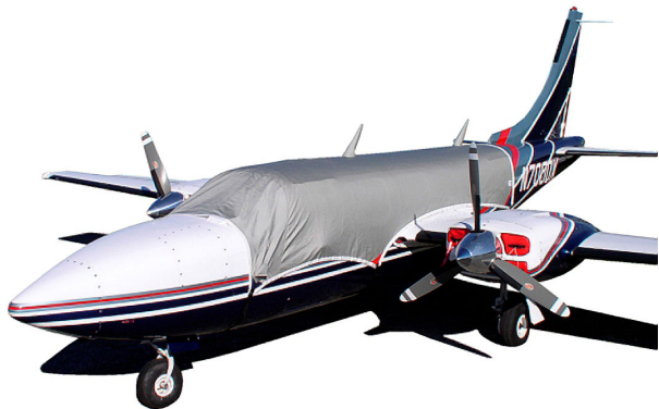
Aerostar Canopy Cover & Plugs