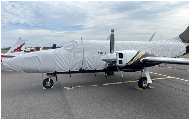
Piper PA-601 Aerostar Fuselage Cover (back to Horiz Stab)

The Piper PA-601 Aerostar Nose Cover is designed to cover the section of the fuselage forward of the windshield to the tip of the nose. It is secured with belly straps. This cover type is made from Silver Acrylic Sunbrella canvas and is 100% lined with a soft and smooth microfiber. Bruce's Custom Covers developed this material combination especially for aircraft protection. The outer material is medium weight and treated for water resistance, UV resistance and anti-static buildup. The inner lining is a very soft and smooth microfiber to prevent scratching. The material is very reflective, and tests show that the cabin interior temperature can be reduced to near-ambient temperature on the hottest of days. It is water, ice and snow repellent, yet breathable to allow moisture to escape from between the cover and the aircraft surface.