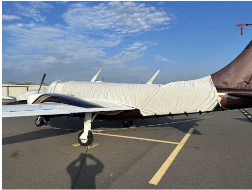
Piper PA-601 Aerostar Fuselage Cover (back to Horiz Stab)

The Piper PA-601 Aerostar Nose Cover is designed to cover the section of the fuselage forward of the windshield to the tip of the nose. It is secured with belly straps. This cover type is made from Silver Acrylic Sunbrella canvas and is 100% lined with a soft and smooth microfiber. Bruce's Custom Covers developed this material combination especially for aircraft protection. The outer material is medium weight and treated for water resistance, UV resistance and anti-static buildup. The inner lining is a very soft and smooth microfiber to prevent scratching. The material is very reflective, and tests show that the cabin interior temperature can be reduced to near-ambient temperature on the hottest of days. It is water, ice and snow repellent, yet breathable to allow moisture to escape from between the cover and the aircraft surface.