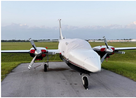
Piper PA-601 Aerostar Canopy Cover (Windows Only), Engine Plugs