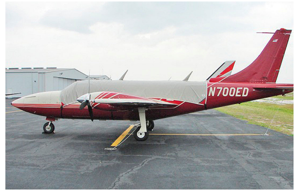
Piper Aerostar Canopy Cover, extended over baggage door