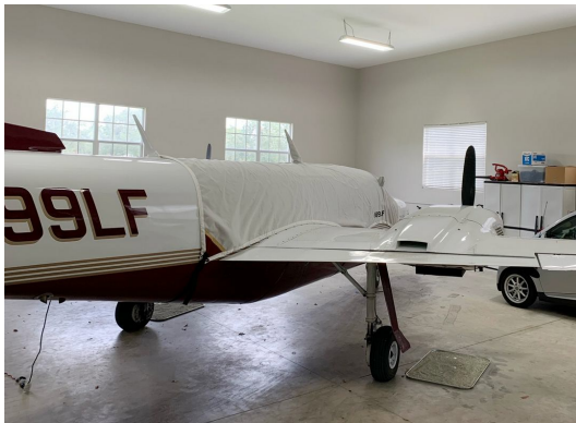
Piper Aerostar PA-60-700P Canopy Cover Windows Only

The Piper PA-601 Aerostar Nose Cover is designed to cover the section of the fuselage forward of the windshield to the tip of the nose. It is secured with belly straps. This cover type is made from Silver Acrylic Sunbrella canvas and is 100% lined with a soft and smooth microfiber. Bruce's Custom Covers developed this material combination especially for aircraft protection. The outer material is medium weight and treated for water resistance, UV resistance and anti-static buildup. The inner lining is a very soft and smooth microfiber to prevent scratching. The material is very reflective, and tests show that the cabin interior temperature can be reduced to near-ambient temperature on the hottest of days. It is water, ice and snow repellent, yet breathable to allow moisture to escape from between the cover and the aircraft surface.