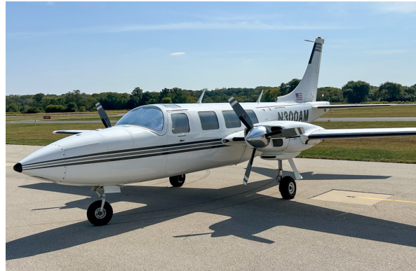
Aerostar 601P Windshield Heatshield

Windshield Heatshields are interior sunshades for an aircraft's front windshield. The product is a unique composite of closed-cell foam with a silver mylar finish. The semi-rigid design is stiff enough to stand along the inside of the windshield using sun visors or window framing. It folds up flat and easily stores in the included storage sleeve. Some designs may require velcro and suction cups or split right and left sides. A Heatshield is an excellent short-term remedy for cockpit overheating. An external fabric cover is far more effective and practical for long-term protection.