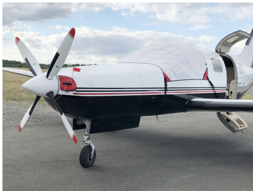
Piper PA-46-50P Malibu Mirage Cockpit Cover

This cover type is made from Silver Acrylic Sunbrella canvas and is 100% lined with a soft and smooth microfiber. Bruce's Custom Covers developed this material combination especially for aircraft protection. The outer material is medium weight and treated for water resistance, UV resistance and anti-static buildup. The inner lining is a very soft and smooth microfiber to prevent scratching. The material is very reflective, and tests show that the cabin interior temperature can be reduced to near-ambient temperature on the hottest of days. It is water, ice and snow repellent, yet breathable to allow moisture to escape from between the cover and the aircraft surface.