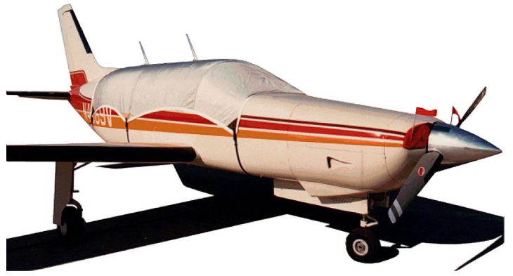
Malibu/Mirage/Meridian Standard Canopy Cover