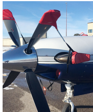
Piper PA46TP-500 Meridian Prop Tie/Exhaust Covers, Engine Plugs