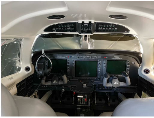
Piper PA46-500TP Cockpit Heatshields