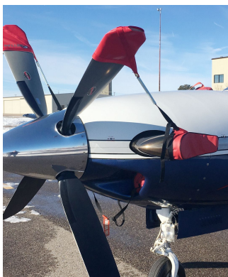
Piper PA46TP-500 Meridian Prop Tie/Exhaust Covers, Engine Plugs

This cover type is made from Silver Acrylic Sunbrella canvas and is 100% lined with a soft and smooth microfiber. Bruce's Custom Covers developed this material combination especially for aircraft protection. The outer material is medium weight and treated for water resistance, UV resistance and anti-static buildup. The inner lining is a very soft and smooth microfiber to prevent scratching. The material is very reflective, and tests show that the cabin interior temperature can be reduced to near-ambient temperature on the hottest of days. It is water, ice and snow repellent, yet breathable to allow moisture to escape from between the cover and the aircraft surface.