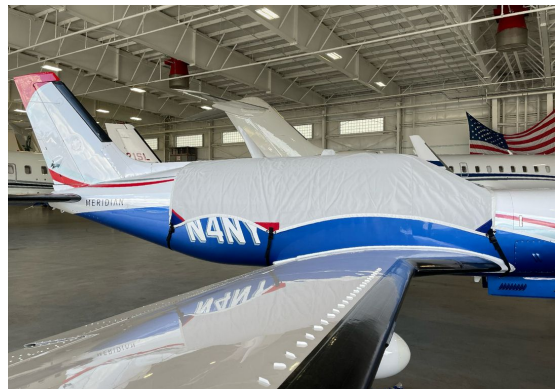
Piper PA46-500TP Canopy Cover