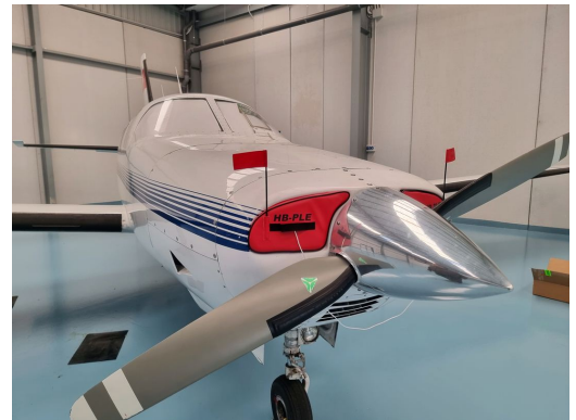
Piper PA-46 Malibu Engine Inlet Plugs