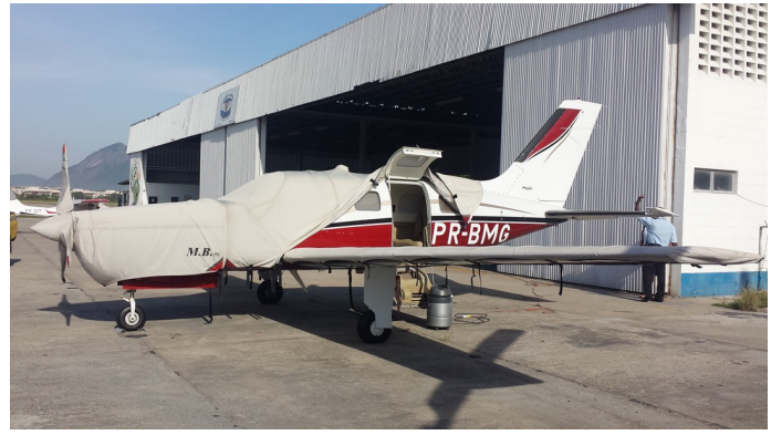
Piper Malibu/Mirage Extended Canopy Cover, Engine, Prop & Wing Covers