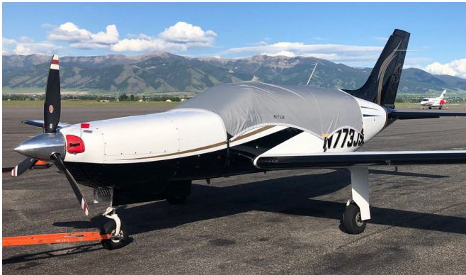
Piper PA46-350P Travel Canopy Cover, Engine Plugs

Travel Covers are made with Silver Solution-Dyed Polyester fabric and only lined over the windshield to save weight. The material is lightweight and more compact for easy stowage in the aircraft. The polyester material is water resistant, but only intended for occasional use outside. We also have an ultra lightweight material available for fitted hangar dust covers. For daily outdoor use, the non-travel Sunbrella Cover is the best choice.