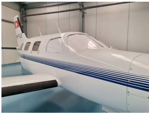
Piper PA-46 Malibu Cockpit Heatshields