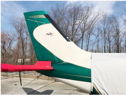
Piper Malibu/Mirage Horizontal Stabilizer/Tailcone Cover