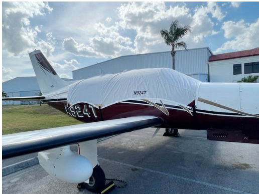
Piper Aircraft Inc PA-46-350P Canopy Cover