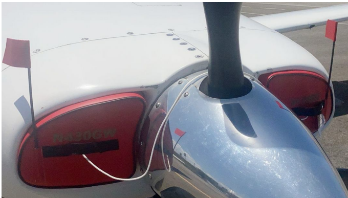
Piper PA-46 Engine Inlet Plugs

Engine Inlet Plugs are custom fit for your Piper PA-46-350P Mirage, Matrix, JetProp intakes, made with heavy-duty vinyl material, and stuffed with a single block of sculpted urethane foam. Each plug has a zipper that allows the foam to be removed and dried if necessary. Engine plugs have warning flags that are visible from the cockpit or 'remove before flight' streamers sewn onto the face of the plugs. Most plugs are imprinted with the aircraft registration number in black for an extra charge. Storage bag NOT included. Engine plugs may be inserted after flight when the engine is still warm. Engine Inlet Plugs are commonly referred to as Cowl Plugs, Intake Plugs, Cowl Blocks, Engine Blocks, and Engine Bungs.