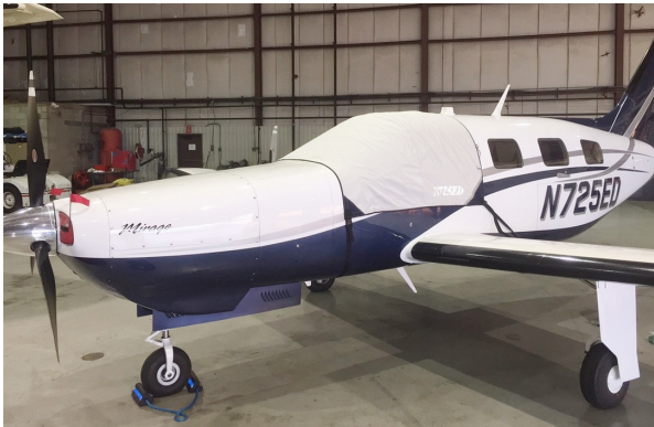
Piper Malibu/Mirage Cockpit Cover, Engine Plugs

This cover type is made from Silver Acrylic Sunbrella canvas and is 100% lined with a soft and smooth microfiber. Bruce's Custom Covers developed this material combination especially for aircraft protection. The outer material is medium weight and treated for water resistance, UV resistance and anti-static buildup. The inner lining is a very soft and smooth microfiber to prevent scratching. The material is very reflective, and tests show that the cabin interior temperature can be reduced to near-ambient temperature on the hottest of days. It is water, ice and snow repellent, yet breathable to allow moisture to escape from between the cover and the aircraft surface.