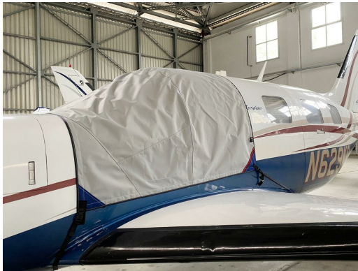
Piper PA-46-500TP Travel Cover Cockpit Cover