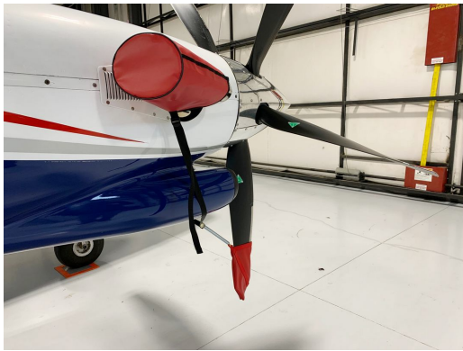
Piper PA-31T Cheyenne II Prop Tie-Downs/Exhaust Covers

This cover type is made from Silver Acrylic Sunbrella canvas and is 100% lined with a soft and smooth microfiber. Bruce's Custom Covers developed this material combination especially for aircraft protection. The outer material is medium weight and treated for water resistance, UV resistance and anti-static buildup. The inner lining is a very soft and smooth microfiber to prevent scratching. The material is very reflective, and tests show that the cabin interior temperature can be reduced to near-ambient temperature on the hottest of days. It is water, ice and snow repellent, yet breathable to allow moisture to escape from between the cover and the aircraft surface.