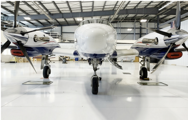
Piper Cheyenne Engine Inlet Plugs

Engine Inlet Plugs are custom fit for your Piper PA-31T: Cheyenne, Cheyenne II XL intakes, made with heavy-duty vinyl material, and stuffed with a single block of sculpted urethane foam. Each plug has a zipper that allows the foam to be removed and dried if necessary. Engine plugs have warning flags that are visible from the cockpit or 'remove before flight' streamers sewn onto the face of the plugs. Most plugs are imprinted with the aircraft registration number in black for an extra charge. Storage bag NOT included. Engine plugs may be inserted after flight when the engine is still warm. Engine Inlet Plugs are commonly referred to as Cowl Plugs, Intake Plugs, Cowl Blocks, Engine Blocks, and Engine Bungs.