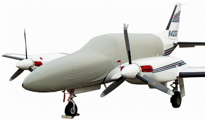
Piper Navajo CR Canopy/Nose Cover

This cover type is made from Silver Acrylic Sunbrella canvas and is 100% lined with a soft and smooth microfiber. Bruce's Custom Covers developed this material combination especially for aircraft protection. The outer material is medium weight and treated for water resistance, UV resistance and anti-static buildup. The inner lining is a very soft and smooth microfiber to prevent scratching. The material is very reflective, and tests show that the cabin interior temperature can be reduced to near-ambient temperature on the hottest of days. It is water, ice and snow repellent, yet breathable to allow moisture to escape from between the cover and the aircraft surface.