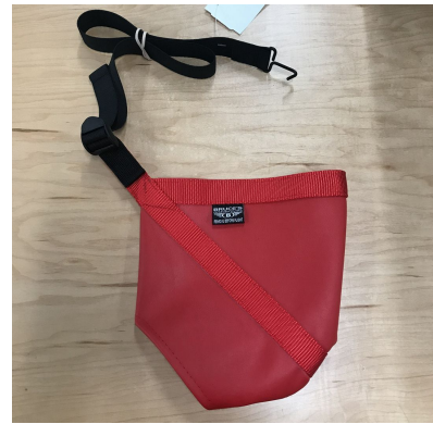
Prop Tie-Down, Various Models (secures with a hook to engine nacelle)