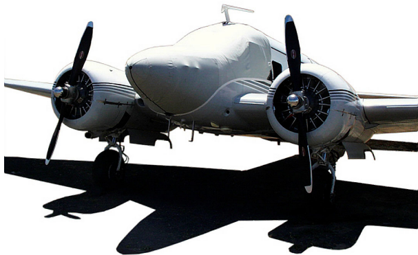
Beech 18 Cockpit/Nose Cover

This cover type is made from Silver Acrylic Sunbrella canvas and is 100% lined with a soft and smooth microfiber. Bruce's Custom Covers developed this material combination especially for aircraft protection. The outer material is medium weight and treated for water resistance, UV resistance and anti-static buildup. The inner lining is a very soft and smooth microfiber to prevent scratching. The material is very reflective, and tests show that the cabin interior temperature can be reduced to near-ambient temperature on the hottest of days. It is water, ice and snow repellent, yet breathable to allow moisture to escape from between the cover and the aircraft surface.