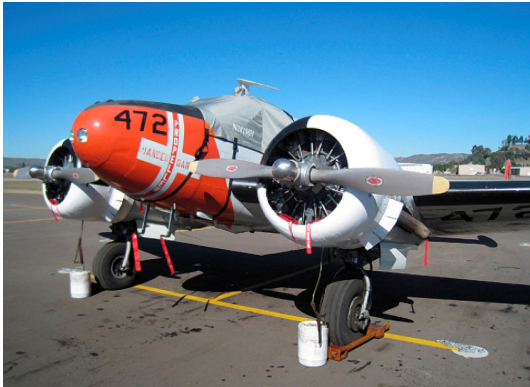
Beech 18 Cockpit Cover and Carb Air Inlet Plugs

This cover type is made from Silver Acrylic Sunbrella canvas and is 100% lined with a soft and smooth microfiber. Bruce's Custom Covers developed this material combination especially for aircraft protection. The outer material is medium weight and treated for water resistance, UV resistance and anti-static buildup. The inner lining is a very soft and smooth microfiber to prevent scratching. The material is very reflective, and tests show that the cabin interior temperature can be reduced to near-ambient temperature on the hottest of days. It is water, ice and snow repellent, yet breathable to allow moisture to escape from between the cover and the aircraft surface.