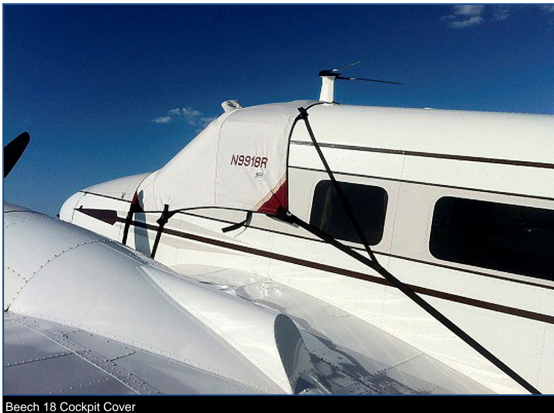
Beech 18 Cockpit Cover