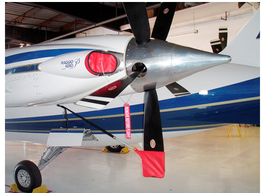
Piaggio 180 Exhaust Covers, Prop Ties