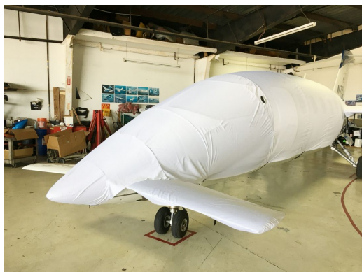
Piaggio P180 Fuselage/Canard Cover & Wing/Engine Covers (test fit covers)

WINTER USE MATERIAL - Made with Solution-Dyed Polyester fabric, this option is intended for seasonal use to aid in deicing, rain mitigation, or for occasional travel. The material is lighter and more compact, but more susceptible to UV damage and may have a shorter useful life if used continuously outside than the all-year use material.