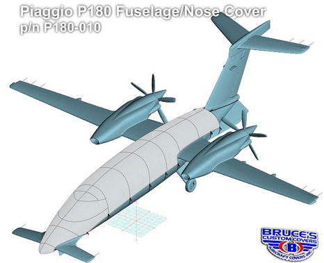
Piaggio 180 Fuselage/Nose Cover