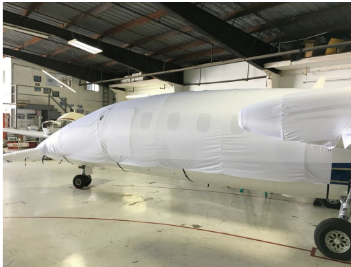
Piaggio P180 Fuselage/Canard Cover & Wing/Engine Covers (test fit covers)

Travel Covers are made with Silver Solution-Dyed Polyester fabric and only lined over the windshield to save weight. The material is lightweight and more compact for easy stowage in the aircraft. The polyester material is water resistant, but only intended for occasional use outside. We also have an ultra lightweight material available for fitted hangar dust covers. For daily outdoor use, the non-travel Sunbrella Cover is the best choice.