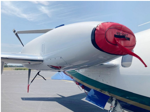
Piaggio P180 Intake Plugs with Fabric Extension

Engine Inlet Plugs are custom fit for your Piaggio Avanti P180 intakes, made with heavy-duty vinyl material, and stuffed with a single block of sculpted urethane foam. Each plug has a zipper that allows the foam to be removed and dried if necessary. Engine plugs have warning flags that are visible from the cockpit or 'remove before flight' streamers sewn onto the face of the plugs. Most plugs are imprinted with the aircraft registration number in black for an extra charge. Storage bag NOT included. Engine plugs may be inserted after flight when the engine is still warm. Engine Inlet Plugs are commonly referred to as Cowl Plugs, Intake Plugs, Cowl Blocks, Engine Blocks, and Engine Bungs.