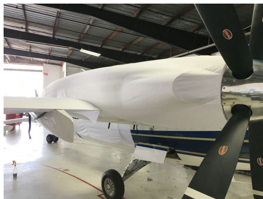
Piaggio P180 Fuselage/Canard Cover & Wing/Engine Covers (test fit covers)