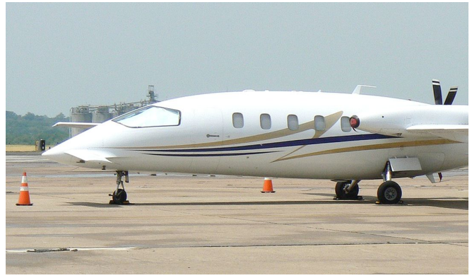
Piaggio Avanti P180 Cockpit Heatshields