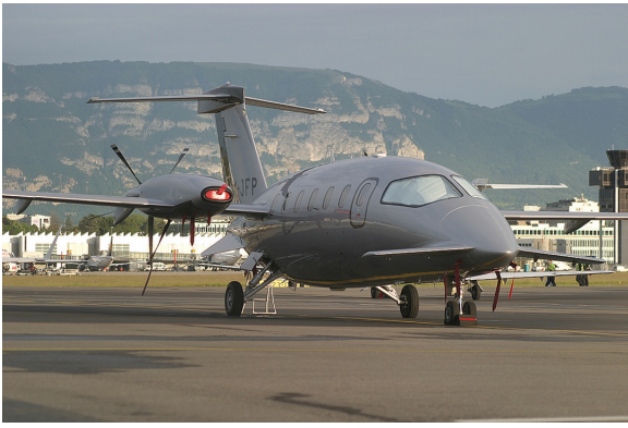
Piaggio 180 Cockpit HeatShields