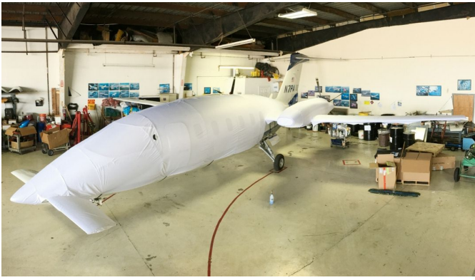
Piaggio P180 Fuselage/Canard Cover & Wing/Engine Covers (test fit covers)