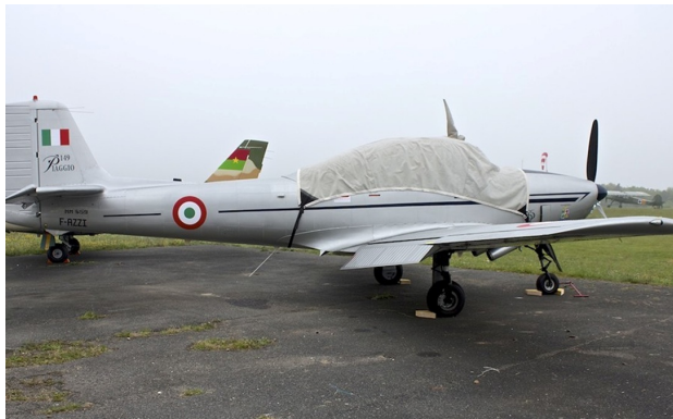
Piaggio P-149 Canopy Cover

Cover and Engine Cover. This cover will enclose the engine cowl and will extend aft to cover all of the windows. This cover type is made from Silver Acrylic Sunbrella canvas and is 100% lined with a soft and smooth microfiber. Bruce's Custom Covers developed this material combination especially for aircraft protection. The outer material is medium weight and treated for water resistance, UV resistance and anti-static buildup. The inner lining is a very soft and smooth microfiber to prevent scratching. The material is very reflective, and tests show that the cabin interior temperature can be reduced to near-ambient temperature on the hottest of days. It is water, ice and snow repellent, yet breathable to allow moisture to escape from between the cover and the aircraft surface.