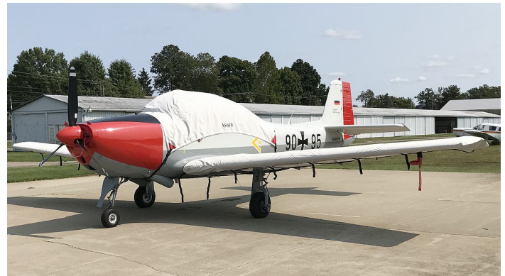
Focke Wulf F149 Canopy Cover, Wing Covers, Engine Plugs