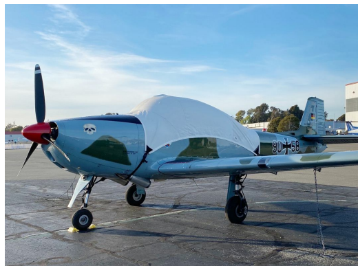
Focke Wulf 149 Trainer Canopy Cover