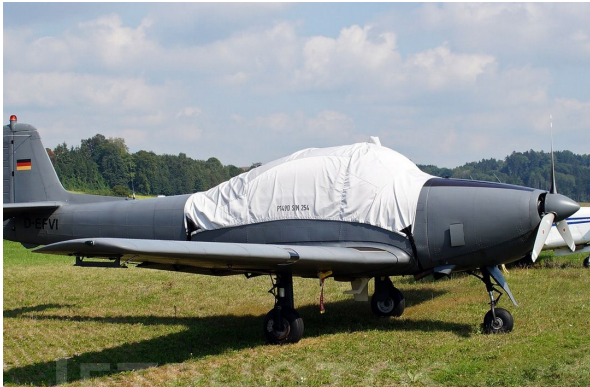
Piaggio P-149 Canopy Cover

Cover and Engine Cover. This cover will enclose the engine cowl and will extend aft to cover all of the windows. This cover type is made from Silver Acrylic Sunbrella canvas and is 100% lined with a soft and smooth microfiber. Bruce's Custom Covers developed this material combination especially for aircraft protection. The outer material is medium weight and treated for water resistance, UV resistance and anti-static buildup. The inner lining is a very soft and smooth microfiber to prevent scratching. The material is very reflective, and tests show that the cabin interior temperature can be reduced to near-ambient temperature on the hottest of days. It is water, ice and snow repellent, yet breathable to allow moisture to escape from between the cover and the aircraft surface.