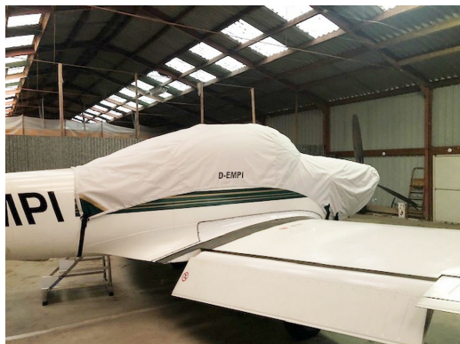
Piaggio FW-149D Canopy/Engine Cover

Cover and Engine Cover. This cover will enclose the engine cowl and will extend aft to cover all of the windows. This cover type is made from Silver Acrylic Sunbrella canvas and is 100% lined with a soft and smooth microfiber. Bruce's Custom Covers developed this material combination especially for aircraft protection. The outer material is medium weight and treated for water resistance, UV resistance and anti-static buildup. The inner lining is a very soft and smooth microfiber to prevent scratching. The material is very reflective, and tests show that the cabin interior temperature can be reduced to near-ambient temperature on the hottest of days. It is water, ice and snow repellent, yet breathable to allow moisture to escape from between the cover and the aircraft surface.