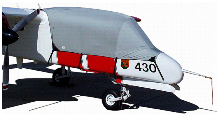
Rockwell OV-10 Canopy Cover