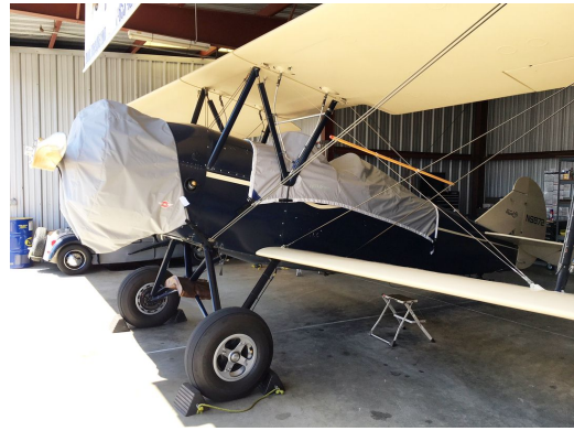
Waco UPF-7 Canopy, Wings, Stab's, Engine, Prop Covers Travel Air 4000 Canopy and Engine Covers, light weight travel type