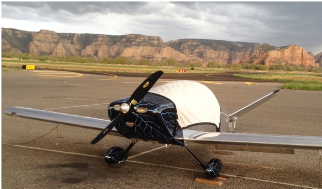
Sonex Canopy Cover