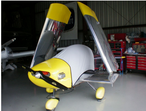
Onex Flyaway Cover