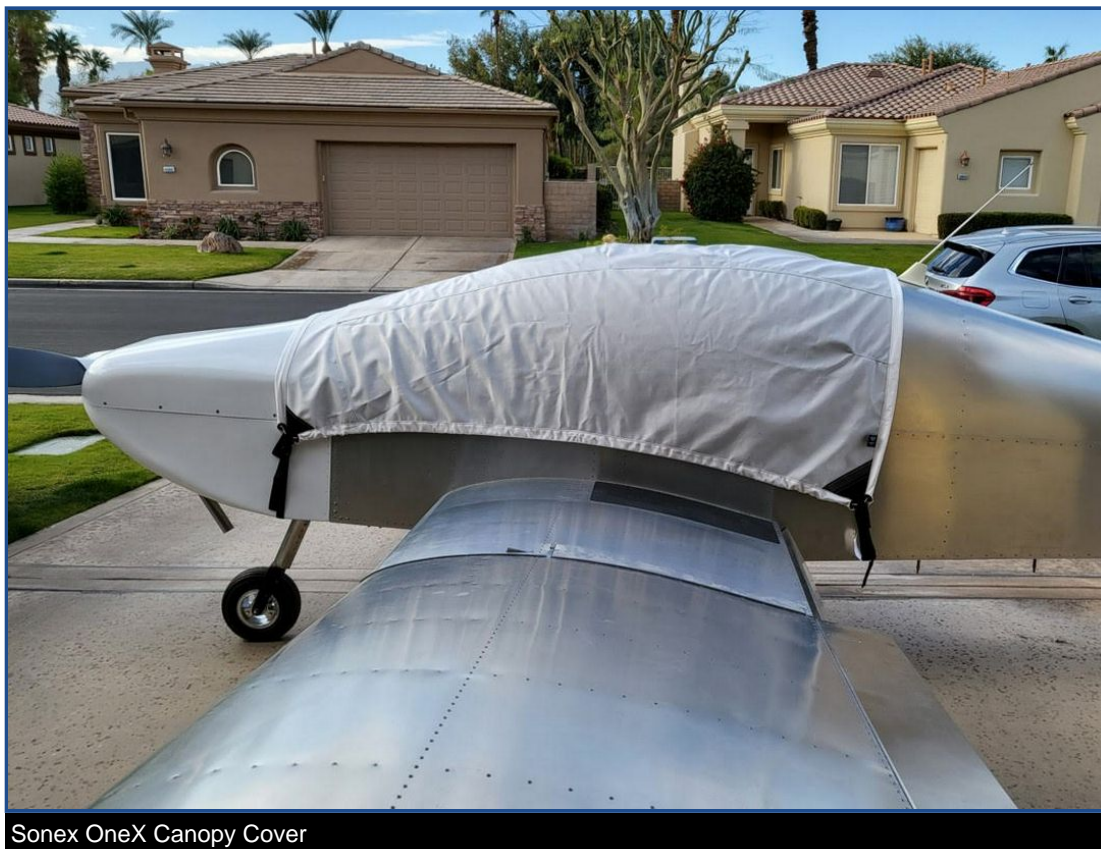
Sonex OneX Canopy Cover