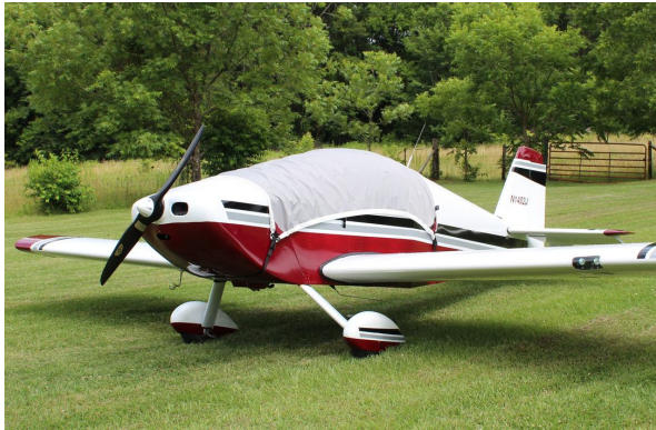
OneX Canopy Cover

Travel Covers are made with Silver Solution-Dyed Polyester fabric and only lined over the windshield to save weight. The material is lightweight and more compact for easy stowage in the aircraft. The polyester material is water resistant, but only intended for occasional use outside. We also have an ultra lightweight material available for fitted hangar dust covers. For daily outdoor use, the non-travel Sunbrella Cover is the best choice.