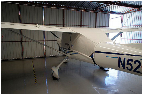
TL Ultralight Sirius Canopy Cover