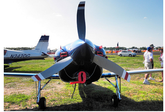
Nemesis NXT Engine Inlet Plug set