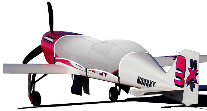
NXT Canopy Cover (illustration)