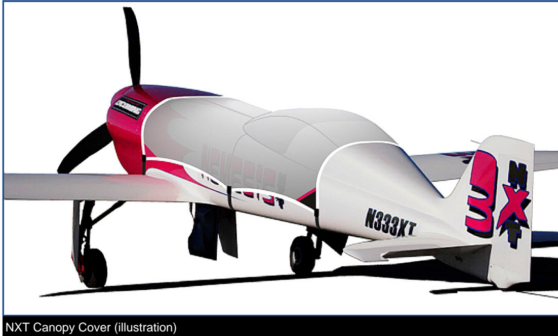
NXT Canopy Cover (illustration)