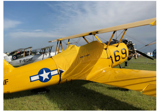
Naval Aircraft Factory N3N Canopy Cover