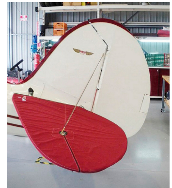
Waco UPF-7 Horizontal Stab. Cover