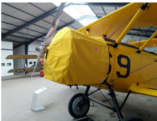
N3N Engine Cover

This cover type is made from Silver Acrylic Sunbrella canvas and is 100% lined with a soft and smooth microfiber. Bruce's Custom Covers developed this material combination especially for aircraft protection. The outer material is medium weight and treated for water resistance, UV resistance and anti-static buildup. The inner lining is a very soft and smooth microfiber to prevent scratching. The material is very reflective, and tests show that the cabin interior temperature can be reduced to near-ambient temperature on the hottest of days. It is water, ice and snow repellent, yet breathable to allow moisture to escape from between the cover and the aircraft surface.