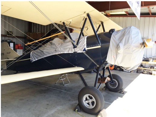
Boeing Stearman PT-13 Canopy, Wing & Horiz. Stab Covers Travel Air 4000 Canopy and Engine Covers, light weight travel type