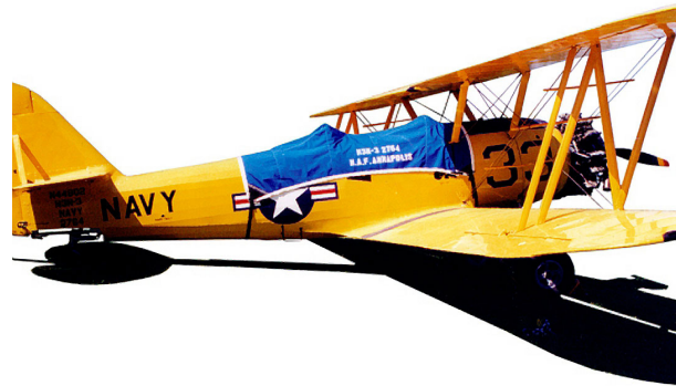
N3N Canopy Cover