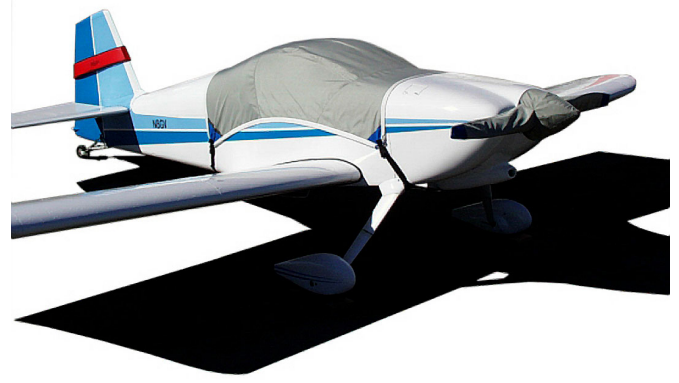
Canopy Cover, Prop Cover