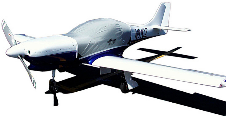
Canopy Cover for Lancair 320/360