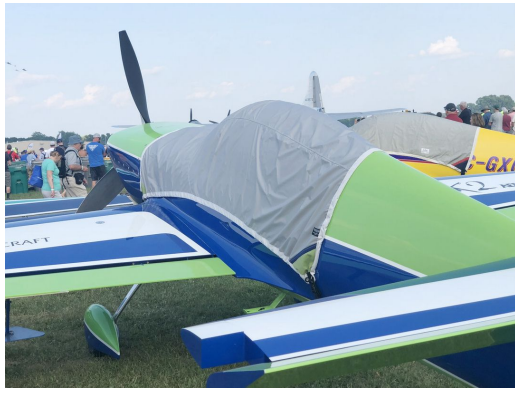
MX2 Lightweight Travel Canopy Cover