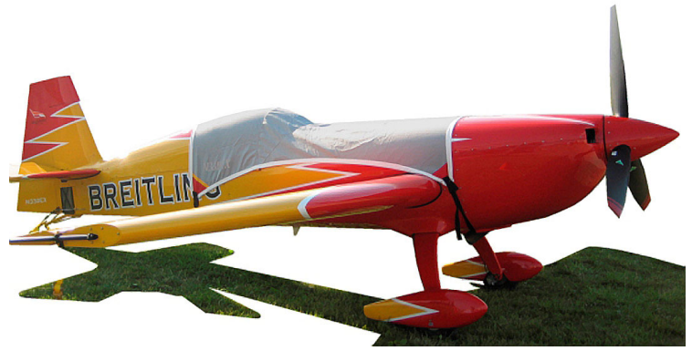
Extra 300sc Canopy Cover