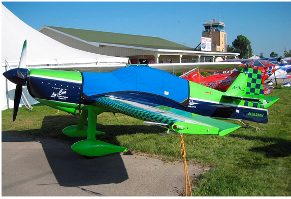
MX-2 Canopy Cover