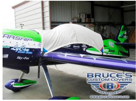
MX-2 Canopy Cover