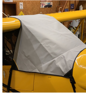
Cub Crafters Carbon Cub FX3 Windshield/Skylight Cover, travel weight