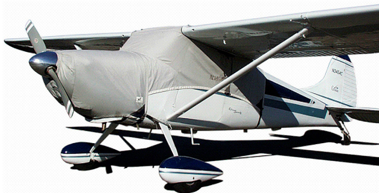
Cessna 170 Canopy Cover & Engine Cover

This cover type is made from Silver Acrylic Sunbrella canvas and is 100% lined with a soft and smooth microfiber. Bruce's Custom Covers developed this material combination especially for aircraft protection. The outer material is medium weight and treated for water resistance, UV resistance and anti-static buildup. The inner lining is a very soft and smooth microfiber to prevent scratching. The material is very reflective, and tests show that the cabin interior temperature can be reduced to near-ambient temperature on the hottest of days. It is water, ice and snow repellent, yet breathable to allow moisture to escape from between the cover and the aircraft surface.