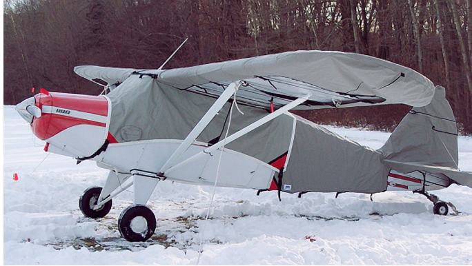
Piper Clipper Canopy Cover, Empennage & Wing Covers, Engine Plugs

WINTER USE MATERIAL - Made with Solution-Dyed Polyester fabric, this option is intended for seasonal use to aid in deicing, rain mitigation, or for occasional travel. The material is lighter and more compact, but more susceptible to UV damage and may have a shorter useful life if used continuously outside than the all-year use material.