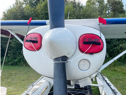
Murphy Rebel Engine Inlet Plugs

Engine Inlet Plugs are custom fit for your Murphy Rebel, Moose, Renegade, Spirit, Elite, etc. intakes, made with heavy-duty vinyl material, and stuffed with a single block of sculpted urethane foam. Each plug has a zipper that allows the foam to be removed and dried if necessary. Engine plugs have warning flags that are visible from the cockpit or 'remove before flight' streamers sewn onto the face of the plugs. Most plugs are imprinted with the aircraft registration number in black for an extra charge. Storage bag NOT included. Engine plugs may be inserted after flight when the engine is still warm. Engine Inlet Plugs are commonly referred to as Cowl Plugs, Intake Plugs, Cowl Blocks, Engine Blocks, and Engine Bungs.