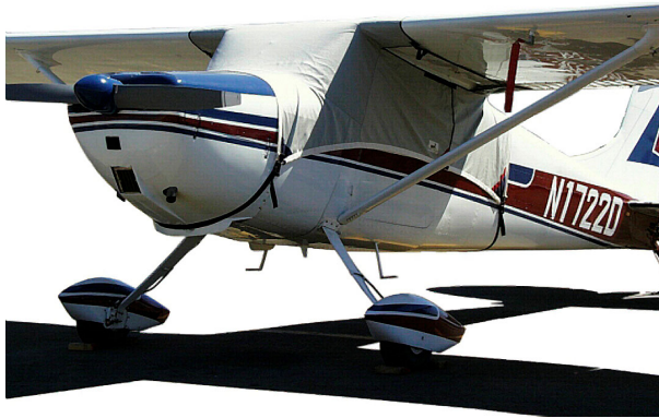
Over-the-Top Canopy Cover

This cover type is made from Silver Acrylic Sunbrella canvas and is 100% lined with a soft and smooth microfiber. Bruce's Custom Covers developed this material combination especially for aircraft protection. The outer material is medium weight and treated for water resistance, UV resistance and anti-static buildup. The inner lining is a very soft and smooth microfiber to prevent scratching. The material is very reflective, and tests show that the cabin interior temperature can be reduced to near-ambient temperature on the hottest of days. It is water, ice and snow repellent, yet breathable to allow moisture to escape from between the cover and the aircraft surface.