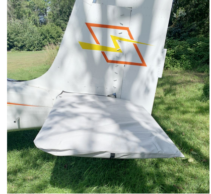
Murphy Elite Horizontal Stabilizer Covers