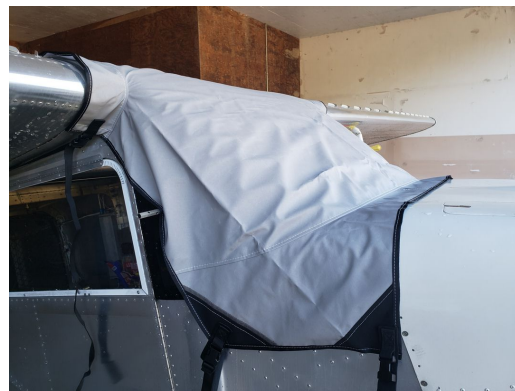
Murphy Rebel, Moose, Renegade, Spirit, Elite, etc. Windshield/Skylight Cover