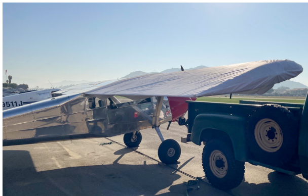
Murphy Elite Wing Covers, test fit cover

WINTER USE MATERIAL - Made with Solution-Dyed Polyester fabric, this option is intended for seasonal use to aid in deicing, rain mitigation, or for occasional travel. The material is lighter and more compact, but more susceptible to UV damage and may have a shorter useful life if used continuously outside than the all-year use material.