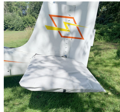
Murphy Elite Horizontal Stabilizer Covers