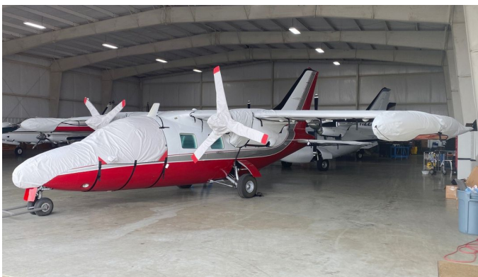
MU-2 Cockpit/Nose, Wing/Engine & Prop Covers

WINTER USE MATERIAL - Made with Solution-Dyed Polyester fabric, this option is intended for seasonal use to aid in deicing, rain mitigation, or for occasional travel. The material is lighter and more compact, but more susceptible to UV damage and may have a shorter useful life if used continuously outside than the all-year use material.