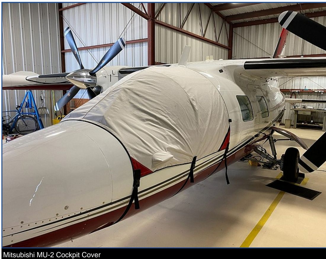
Mitsubishi MU-2 Cockpit Cover