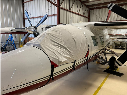
Mitsubishi MU-2 Cockpit Cover