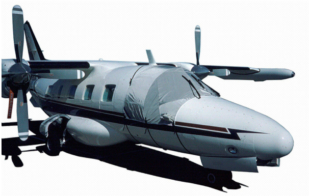
MU-2 Windshield Cover & Engine Plugs

Travel Covers are made with Silver Solution-Dyed Polyester fabric and only lined over the windshield to save weight. The material is lightweight and more compact for easy stowage in the aircraft. The polyester material is water resistant, but only intended for occasional use outside. We also have an ultra lightweight material available for fitted hangar dust covers. For daily outdoor use, the non-travel Sunbrella Cover is the best choice.