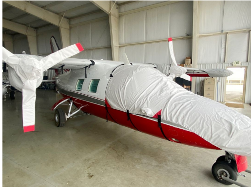
MU-2 Cockpit/Nose, Wing/Engine & Prop Covers

This cover type is made from Silver Acrylic Sunbrella canvas and is 100% lined with a soft and smooth microfiber. Bruce's Custom Covers developed this material combination especially for aircraft protection. The outer material is medium weight and treated for water resistance, UV resistance and anti-static buildup. The inner lining is a very soft and smooth microfiber to prevent scratching. The material is very reflective, and tests show that the cabin interior temperature can be reduced to near-ambient temperature on the hottest of days. It is water, ice and snow repellent, yet breathable to allow moisture to escape from between the cover and the aircraft surface.