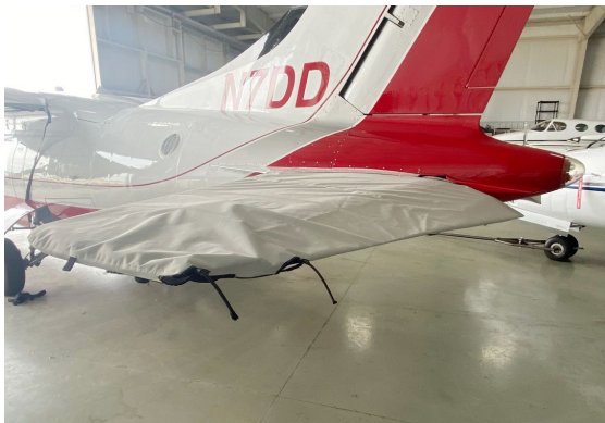
MU-2 Horizontal Stabilizer Covers

WINTER USE MATERIAL - Made with Solution-Dyed Polyester fabric, this option is intended for seasonal use to aid in deicing, rain mitigation, or for occasional travel. The material is lighter and more compact, but more susceptible to UV damage and may have a shorter useful life if used continuously outside than the all-year use material.