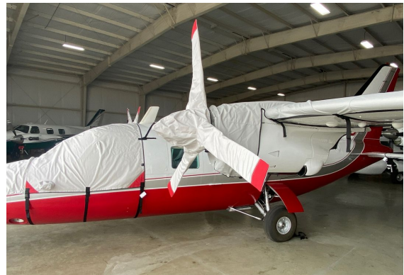
MU-2 Cockpit/Nose, Wing/Engine & Prop Covers