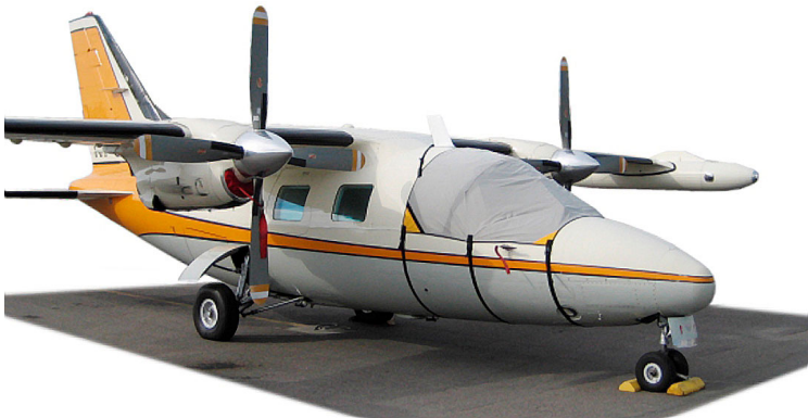
MU-2 Windshield Cover & Engine Plugs