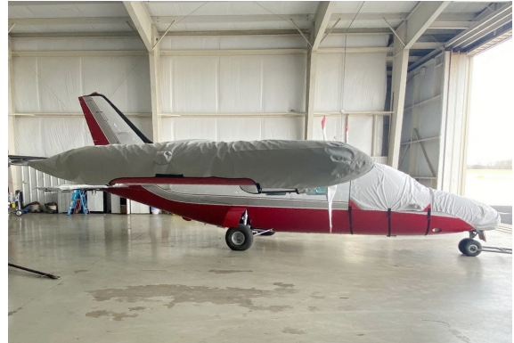
MU-2 Cockpit/Nose, Wing/Engine & Prop Covers