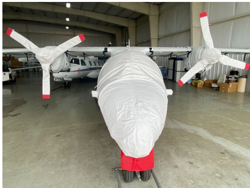
MU-2 Cockpit/Nose, Wing/Engine & Prop Covers

This cover type is made from Silver Acrylic Sunbrella canvas and is 100% lined with a soft and smooth microfiber. Bruce's Custom Covers developed this material combination especially for aircraft protection. The outer material is medium weight and treated for water resistance, UV resistance and anti-static buildup. The inner lining is a very soft and smooth microfiber to prevent scratching. The material is very reflective, and tests show that the cabin interior temperature can be reduced to near-ambient temperature on the hottest of days. It is water, ice and snow repellent, yet breathable to allow moisture to escape from between the cover and the aircraft surface.