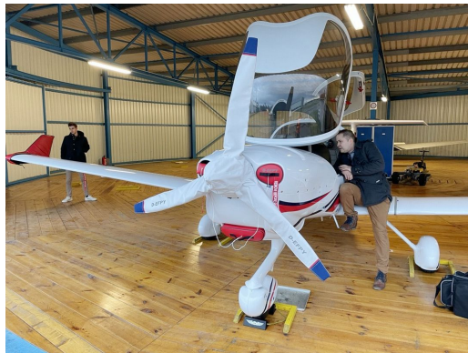
DA40 NG Engine Plugs

Designed to prevent damage to the aircraft extremities in crowded hangars, these products are made of bright red Naugahyde and thickly padded with a sandwich of closed cell foam.