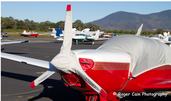
Mooney M20M Bravo 3-Blade Prop Cover, Engine Plugs

This cover type is made from Silver Acrylic Sunbrella canvas and is 100% lined with a soft and smooth microfiber. Bruce's Custom Covers developed this material combination especially for aircraft protection. The outer material is medium weight and treated for water resistance, UV resistance and anti-static buildup. The inner lining is a very soft and smooth microfiber to prevent scratching. The material is very reflective, and tests show that the cabin interior temperature can be reduced to near-ambient temperature on the hottest of days. It is water, ice and snow repellent, yet breathable to allow moisture to escape from between the cover and the aircraft surface.