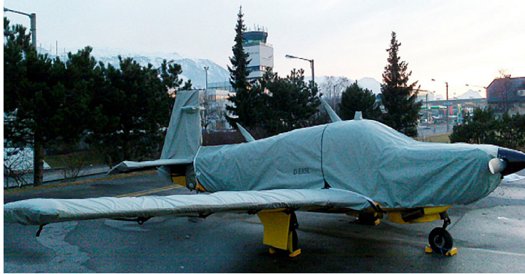
Mooney 231 Extra Extended Canopy/Engine Cover, Wing covers & Empennage Cover

WINTER USE MATERIAL - Made with Solution-Dyed Polyester fabric, this option is intended for seasonal use to aid in deicing, rain mitigation, or for occasional travel. The material is lighter and more compact, but more susceptible to UV damage and may have a shorter useful life if used continuously outside than the all-year use material.