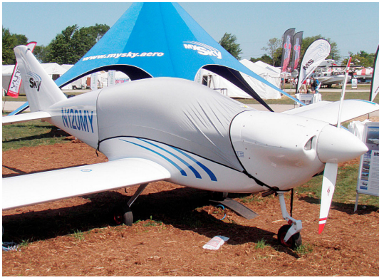
MySky Fly-Away Travel Cover