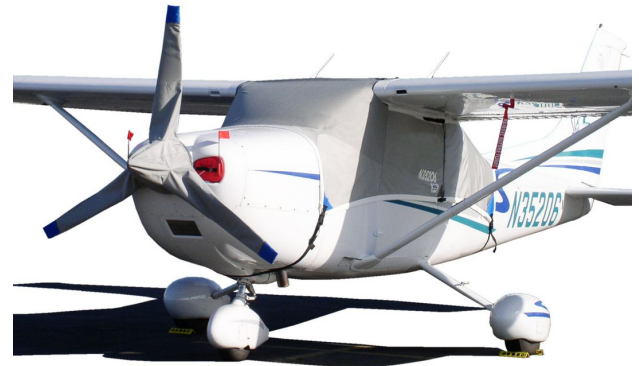
Cessna 182 Canopy Cover, Engine Plugs, 3-Blade Prop Cover