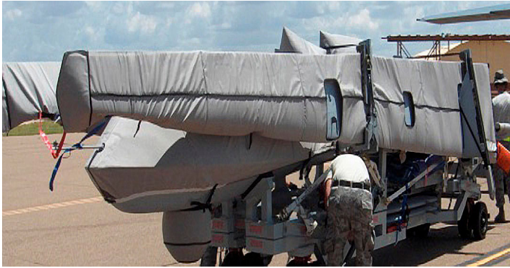
MQ1 Fuselage and Wing Covers

This cover type is made from Silver Acrylic Sunbrella canvas and is 100% lined with a soft and smooth microfiber. Bruce's Custom Covers developed this material combination especially for aircraft protection. The outer material is medium weight and treated for water resistance, UV resistance and anti-static buildup. The inner lining is a very soft and smooth microfiber to prevent scratching. The material is very reflective, and tests show that the cabin interior temperature can be reduced to near-ambient temperature on the hottest of days. It is water, ice and snow repellent, yet breathable to allow moisture to escape from between the cover and the aircraft surface.