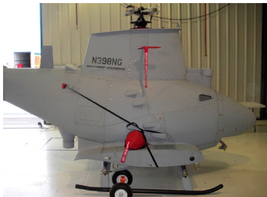
Covers & Plugs for the Northrup Grumman MQ-8 Fire Scout

necessary. Engine plugs have 'Remove Before Flight' streamers sewn onto the face of the plugs. Most plugs are imprinted with the aircraft registration number in black for an extra charge. Storage bag NOT included. Engine plugs may be inserted after flight when the engine is still warm. Engine Inlet Plugs are commonly referred to as Cowl Plugs, Intake Plugs, Cowl Blocks, Engine Blocks, and Engine Bunges.