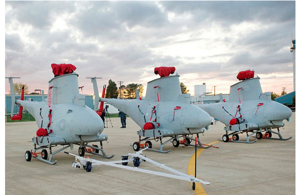
Covers & Plugs for the Northrup Grumman MQ-8 Fire Scout