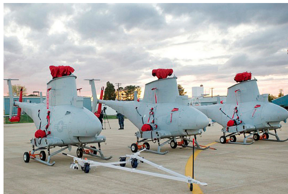
Northrup Grumman MQ-8 Firescout Plugs and Covers