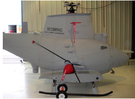
Covers & Plugs for the Northrop Grumman MQ-8 Fire Scout