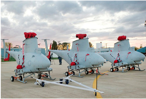
Northrop Grumman MQ-8 Fire Scout Plugs and Covers

necessary. Engine plugs have 'Remove Before Flight' streamers sewn onto the face of the plugs. Most plugs are imprinted with the aircraft registration number in black for an extra charge. Storage bag NOT included. Engine plugs may be inserted after flight when the engine is still warm. Engine Inlet Plugs are commonly referred to as Cowl Plugs, Intake Plugs, Cowl Blocks, Engine Blocks, and Engine Bungs.