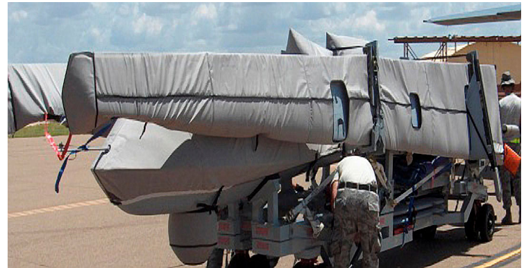
MQ1 Fuselage and Wing Covers