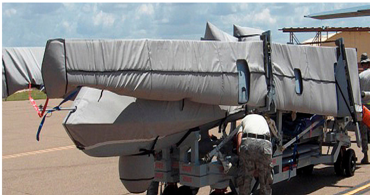
MQ1 Fuselage and Wing Covers

WINTER USE MATERIAL - Made with Solution-Dyed Polyester fabric, this option is intended for seasonal use to aid in deicing, rain mitigation, or for occasional travel. The material is lighter and more compact, but more susceptible to UV damage and may have a shorter useful life if used continuously outside than the all-year use material.