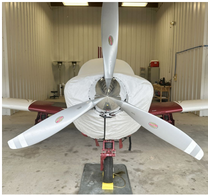
Mooney M20R Extended Canopy/Engine Cover

This cover type is made from Silver Acrylic Sunbrella canvas and is 100% lined with a soft and smooth microfiber. Bruce's Custom Covers developed this material combination especially for aircraft protection. The outer material is medium weight and treated for water resistance, UV resistance and anti-static buildup. The inner lining is a very soft and smooth microfiber to prevent scratching. The material is very reflective, and tests show that the cabin interior temperature can be reduced to near-ambient temperature on the hottest of days. It is water, ice and snow repellent, yet breathable to allow moisture to escape from between the cover and the aircraft surface.