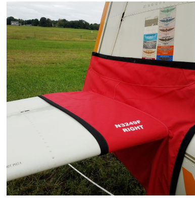
Mooney M20E Tailcone Cover