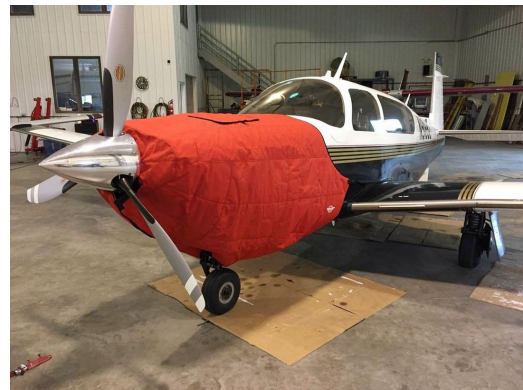
Mooney Ovation Insulated Engine Cover