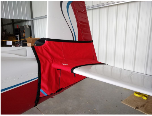
Mooney Tailcone Cover