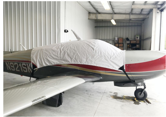
Mooney M20R Canopy Cover