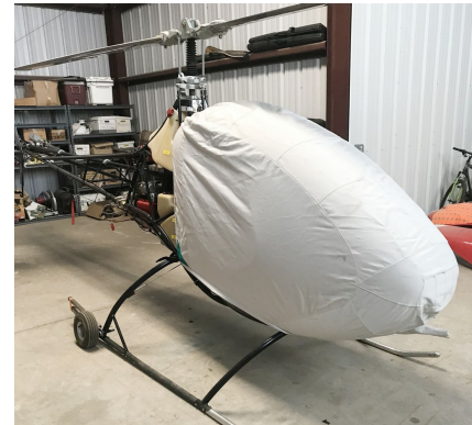
Helicycle Bubble Cover