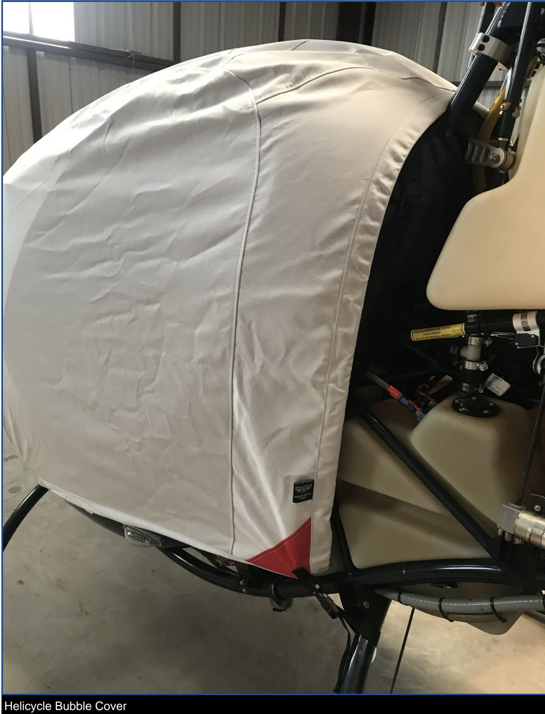
Helicycle Bubble Cover