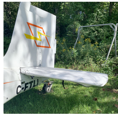
Murphy Elite Horizontal Stabilizer Covers