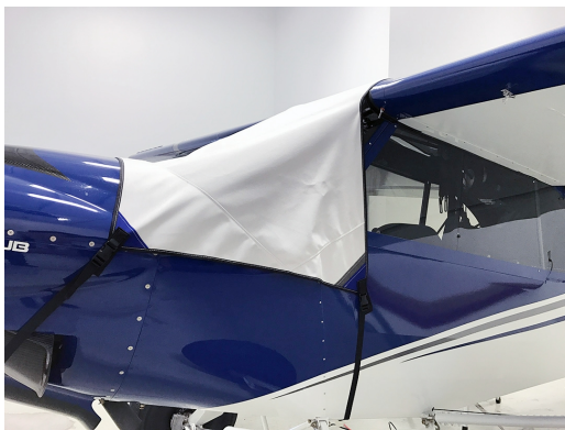
Cub Crafters CC-11 Windshield Cover

This cover type is made from Silver Acrylic Sunbrella canvas and is 100% lined with a soft and smooth microfiber. Bruce's Custom Covers developed this material combination especially for aircraft protection. The outer material is medium weight and treated for water resistance, UV resistance and anti-static buildup. The inner lining is a very soft and smooth microfiber to prevent scratching. The material is very reflective, and tests show that the cabin interior temperature can be reduced to near-ambient temperature on the hottest of days. It is water, ice and snow repellent, yet breathable to allow moisture to escape from between the cover and the aircraft surface.