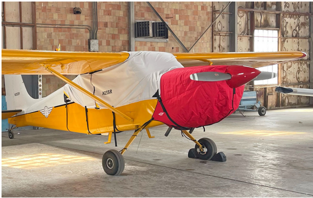
Murphy Super Rebel Insulated Engine Cover

This cover type is made from Silver Acrylic Sunbrella canvas and is 100% lined with a soft and smooth microfiber. Bruce's Custom Covers developed this material combination especially for aircraft protection. The outer material is medium weight and treated for water resistance, UV resistance and anti-static buildup. The inner lining is a very soft and smooth microfiber to prevent scratching. The material is very reflective, and tests show that the cabin interior temperature can be reduced to near-ambient temperature on the hottest of days. It is water, ice and snow repellent, yet breathable to allow moisture to escape from between the cover and the aircraft surface.