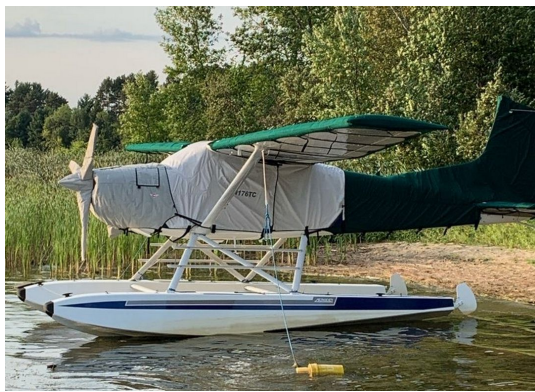
Cessna A185F Complete Cover Set