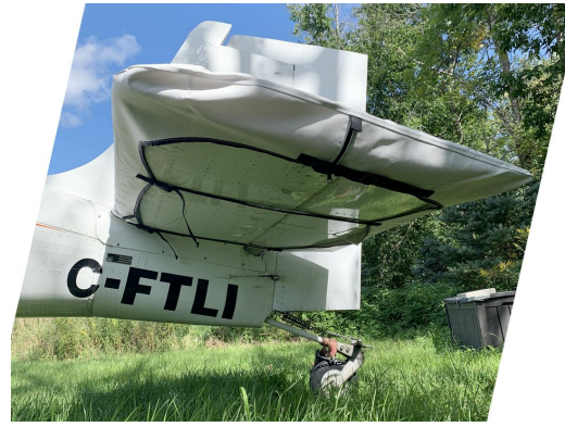
Murphy Elite Horizontal Stabilizer Covers