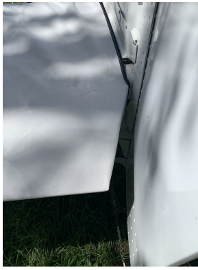
Murphy Elite Horizontal Stabilizer Covers