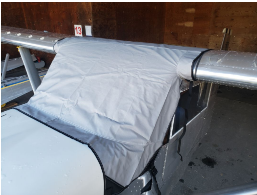
Murphy Rebel, Moose, Renegade, Spirit, Elite, etc. Windshield/Skylight Cover

This cover type is made from Silver Acrylic Sunbrella canvas and is 100% lined with a soft and smooth microfiber. Bruce's Custom Covers developed this material combination especially for aircraft protection. The outer material is medium weight and treated for water resistance, UV resistance and anti-static buildup. The inner lining is a very soft and smooth microfiber to prevent scratching. The material is very reflective, and tests show that the cabin interior temperature can be reduced to near-ambient temperature on the hottest of days. It is water, ice and snow repellent, yet breathable to allow moisture to escape from between the cover and the aircraft surface.