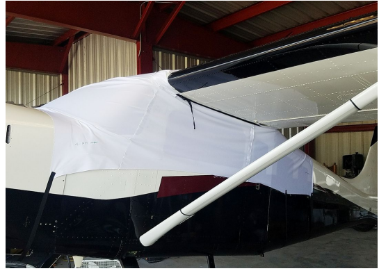
Murphy Moose Canopy Cover (test fit cover)