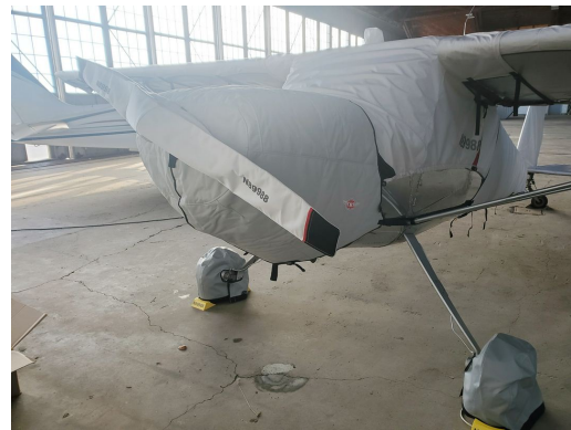
Cessna 140 Canopy, Wings, Prop, Tires & Empennage Covers