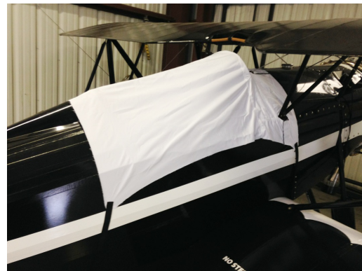
Rose Parrakeet Canopy Cover (test fit cover)