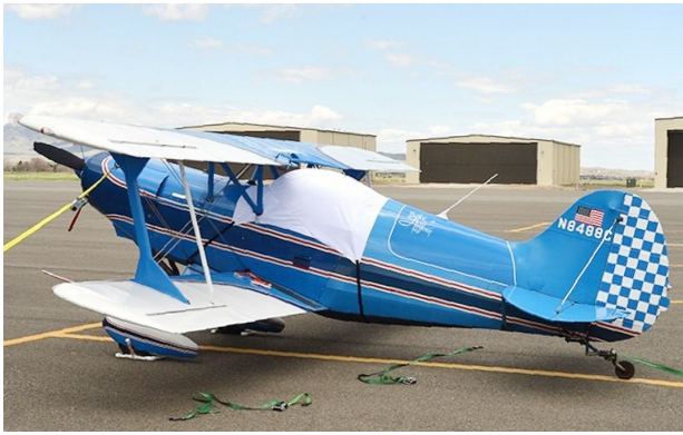
Acro Sport Canopy Cover