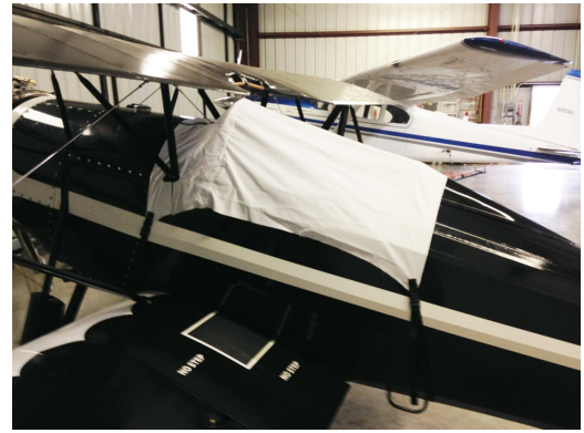
Rose Parrakeet Canopy Cover (test fit cover)