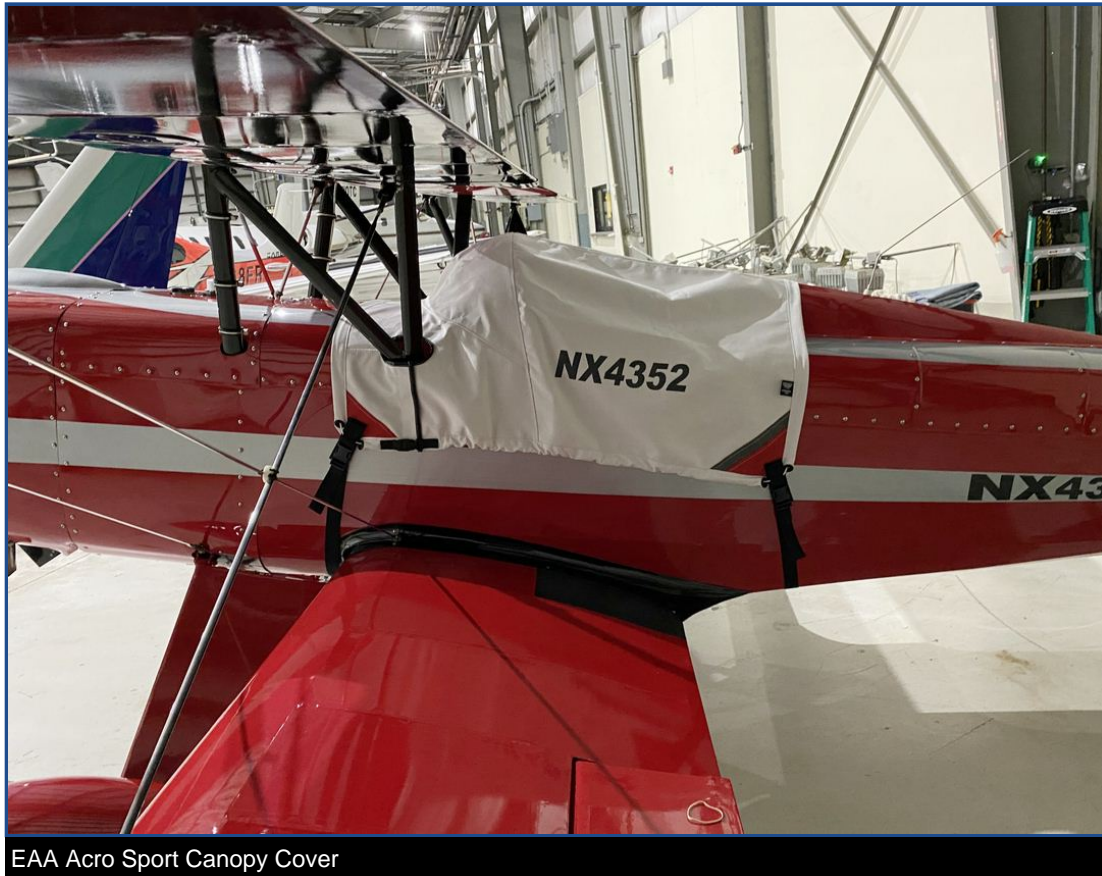
EAA Acro Sport Canopy Cover