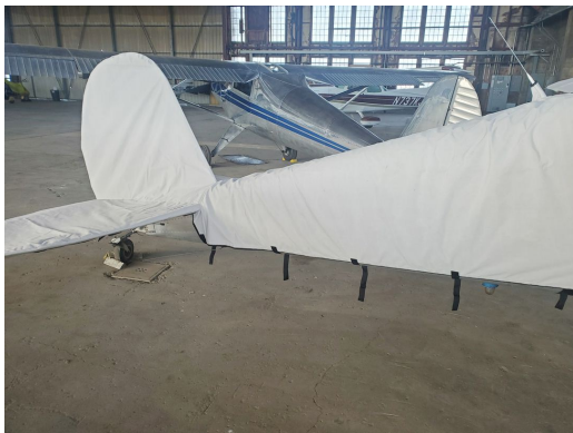
Cessna 140 Empennage Cover

WINTER USE MATERIAL - Made with Solution-Dyed Polyester fabric, this option is intended for seasonal use to aid in deicing, rain mitigation, or for occasional travel. The material is lighter and more compact, but more susceptible to UV damage and may have a shorter useful life if used continuously outside than the all-year use material.