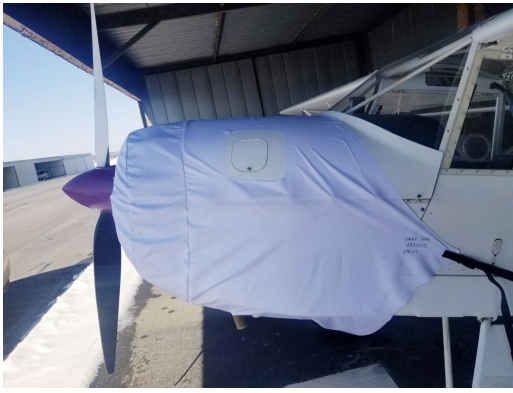
Kitfox Engine Cover, "Radial Cowl" type, test fit