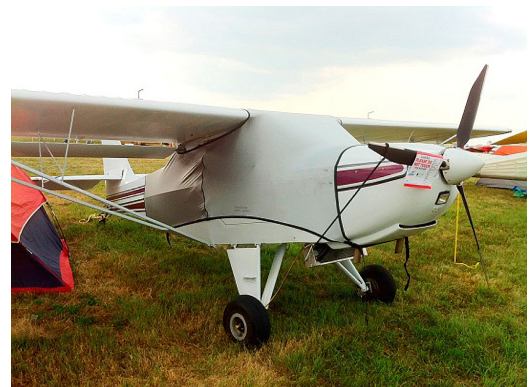
Kitfox Spandex FlyAway Travel Canopy Cover