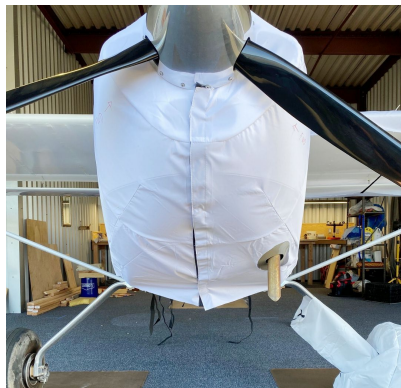
Kitfox Extended Canopy/Engine Cover, test fit cover

This cover type is made from Silver Acrylic Sunbrella canvas and is 100% lined with a soft and smooth microfiber. Bruce's Custom Covers developed this material combination especially for aircraft protection. The outer material is medium weight and treated for water resistance, UV resistance and anti-static buildup. The inner lining is a very soft and smooth microfiber to prevent scratching. The material is very reflective, and tests show that the cabin interior temperature can be reduced to near-ambient temperature on the hottest of days. It is water, ice and snow repellent, yet breathable to allow moisture to escape from between the cover and the aircraft surface.