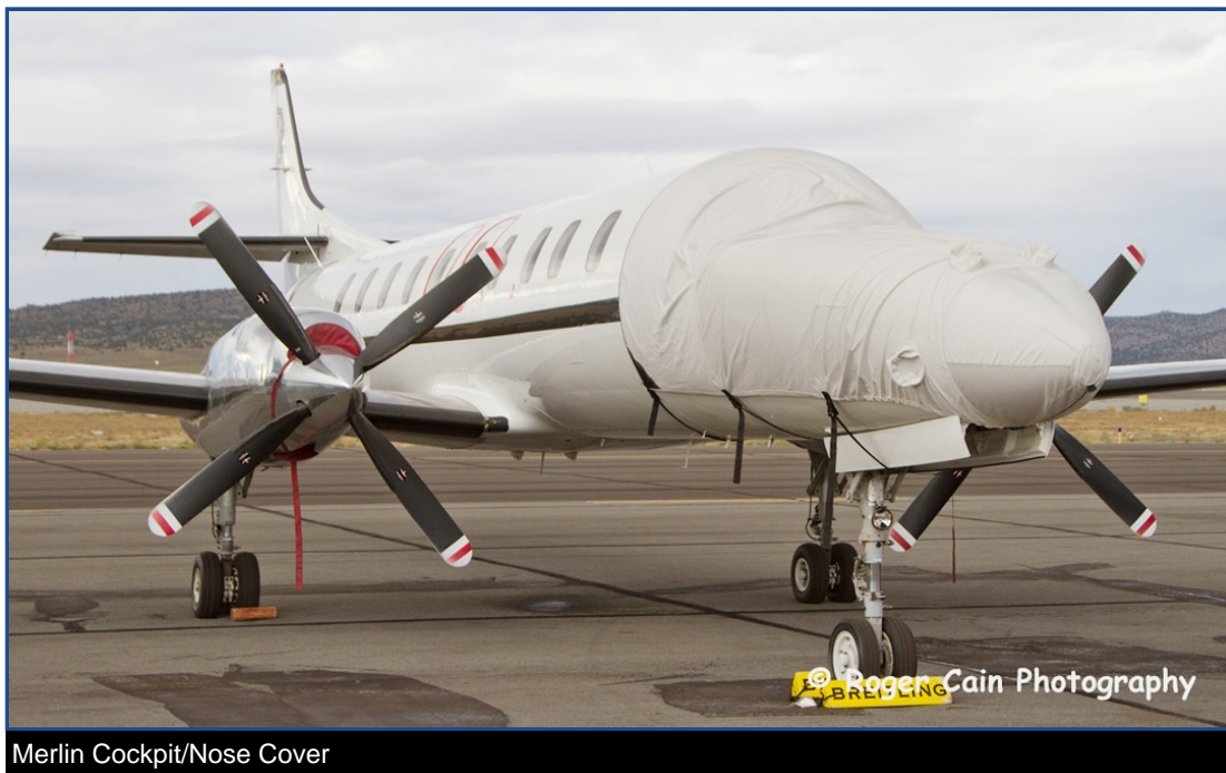
Merlin Cockpit/Nose Cover