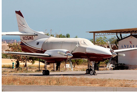
Merlin Canopy Cover

Travel Covers are made with Silver Solution-Dyed Polyester fabric and only lined over the windshield to save weight. The material is lightweight and more compact for easy stowage in the aircraft. The polyester material is water resistant, but only intended for occasional use outside. We also have an ultra lightweight material available for fitted hangar dust covers. For daily outdoor use, the non-travel Sunbrella Cover is the best choice.