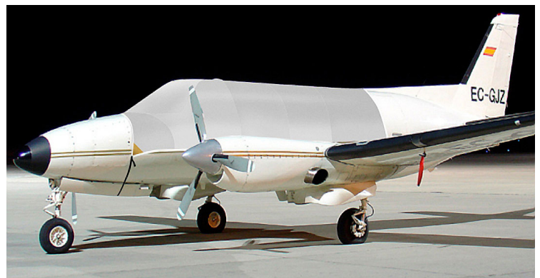
Merlin Canopy Cover (illustration)