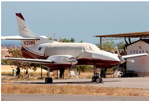
Merlin Canopy Cover