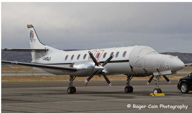
Merlin Cockpit/Nose Cover

This cover type is made from Silver Acrylic Sunbrella canvas and is 100% lined with a soft and smooth microfiber. Bruce's Custom Covers developed this material combination especially for aircraft protection. The outer material is medium weight and treated for water resistance, UV resistance and anti-static buildup. The inner lining is a very soft and smooth microfiber to prevent scratching. The material is very reflective, and tests show that the cabin interior temperature can be reduced to near-ambient temperature on the hottest of days. It is water, ice and snow repellent, yet breathable to allow moisture to escape from between the cover and the aircraft surface.