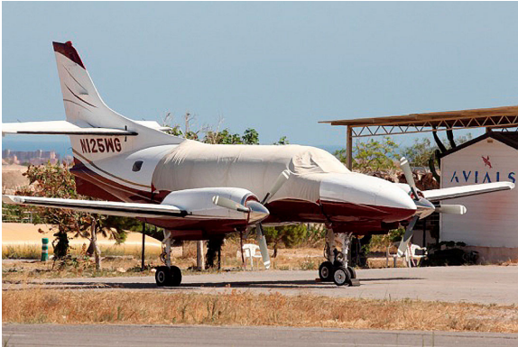
Merlin Canopy Cover

Travel Covers are made with Silver Solution-Dyed Polyester fabric and only lined over the windshield to save weight. The material is lightweight and more compact for easy stowage in the aircraft. The polyester material is water resistant, but only intended for occasional use outside. We also have an ultra lightweight material available for fitted hangar dust covers. For daily outdoor use, the non-travel Sunbrella Cover is the best choice.