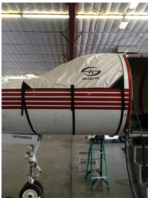
Merlin Cockpit Cover

This cover type is made from Silver Acrylic Sunbrella canvas and is 100% lined with a soft and smooth microfiber. Bruce's Custom Covers developed this material combination especially for aircraft protection. The outer material is medium weight and treated for water resistance, UV resistance and anti-static buildup. The inner lining is a very soft and smooth microfiber to prevent scratching. The material is very reflective, and tests show that the cabin interior temperature can be reduced to near-ambient temperature on the hottest of days. It is water, ice and snow repellent, yet breathable to allow moisture to escape from between the cover and the aircraft surface.