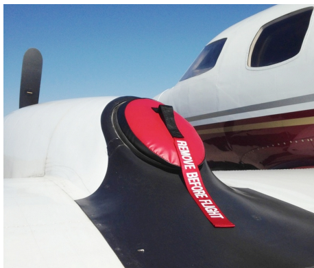
Merlin Exhaust Plug

Engine Inlet Plugs are custom fit for your Swearingen Fairchild Metro Merlin, all models intakes, made with heavy-duty vinyl material, and stuffed with a single block of sculpted urethane foam. Each plug has a zipper that allows the foam to be removed and dried if necessary. Engine plugs have warning flags that are visible from the cockpit or 'remove before flight' streamers sewn onto the face of the plugs. Most plugs are imprinted with the aircraft registration number in black for an extra charge. Storage bag NOT included. Engine plugs may be inserted after flight when the engine is still warm. Engine Inlet Plugs are commonly referred to as Cowl Plugs, Intake Plugs, Cowl Blocks, Engine Blocks, and Engine Bungs.