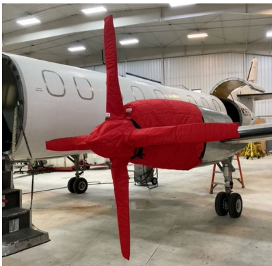
Fairchild Merlin Insulated Engine & Prop Covers

This cover type is made from Silver Acrylic Sunbrella canvas and is 100% lined with a soft and smooth microfiber. Bruce's Custom Covers developed this material combination especially for aircraft protection. The outer material is medium weight and treated for water resistance, UV resistance and anti-static buildup. The inner lining is a very soft and smooth microfiber to prevent scratching. The material is very reflective, and tests show that the cabin interior temperature can be reduced to near-ambient temperature on the hottest of days. It is water, ice and snow repellent, yet breathable to allow moisture to escape from between the cover and the aircraft surface.