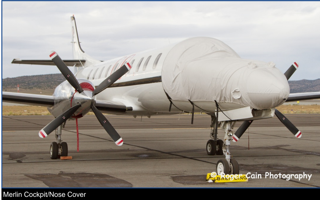
Merlin Cockpit/Nose Cover