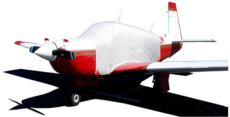
Mooney M20 Extended Canopy Cover & Engine Plugs