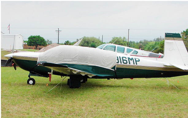
Mooney Ovation Canopy Cover

Travel Covers are made with Silver Solution-Dyed Polyester fabric and only lined over the windshield to save weight. The material is lightweight and more compact for easy stowage in the aircraft. The polyester material is water resistant, but only intended for occasional use outside. We also have an ultra lightweight material available for fitted hangar dust covers. For daily outdoor use, the non-travel Sunbrella Cover is the best choice.