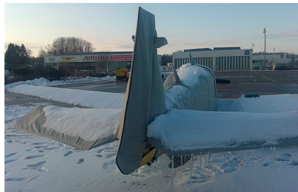
Mooney 231 Full Cover Set...Brrrrrrrr