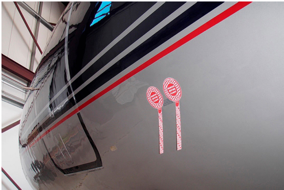
Static Port & Small Inlet/Vent Adhesive Covers: Ideal for Wash Prep and Maintenance