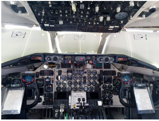
McDonnell Douglas MD80 Cockpit Heatshield Set