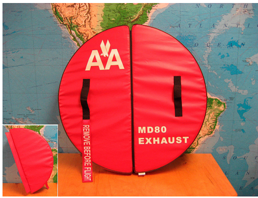
MD-80 Exhaust Plug, folding type