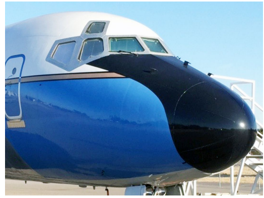
McDonnell Douglas MD80 Cockpit Heatshield Set