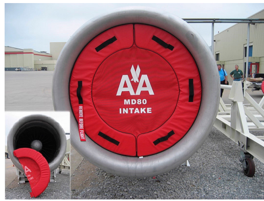
MD-80 JT8D Intake Plug, mesh center & folding type