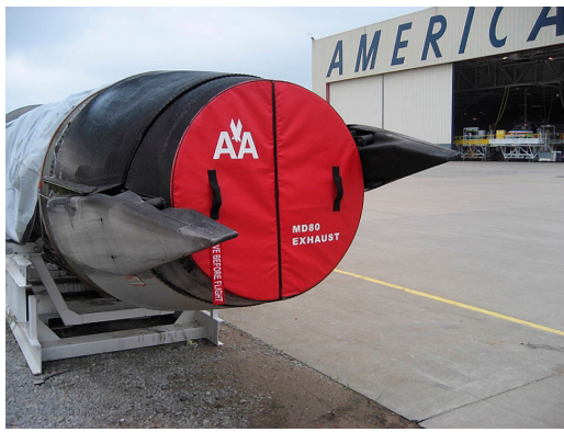
MD80 JT8D Exhaust Plug, Folding Type