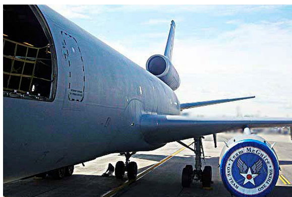
KC-10 Intake Cover at McGuire AFB, NJ