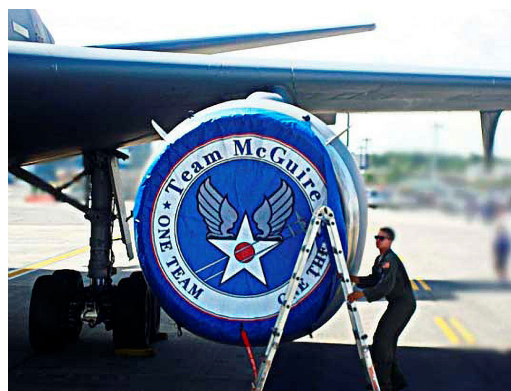
McDonnell Douglas KC-10 Intake Cover