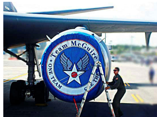
McDonnell Douglas KC-10 Intake Cover