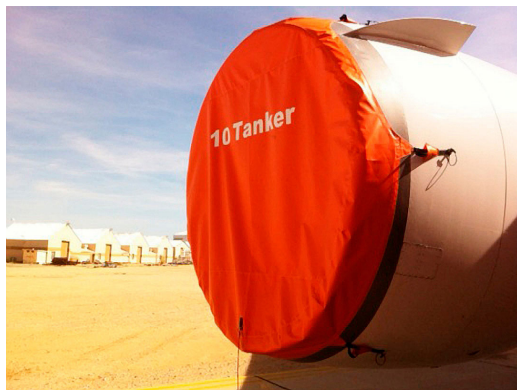
DC-10-30 Intake Cover (CF650C2 Engine)