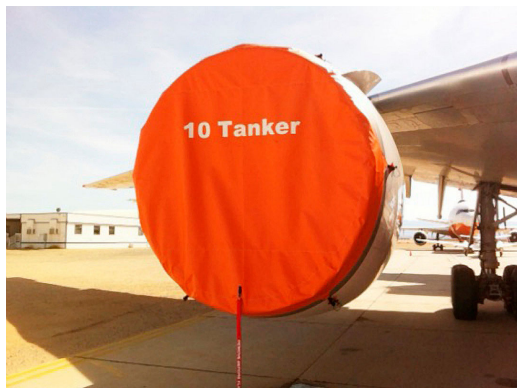
DC-10 Intake Cover