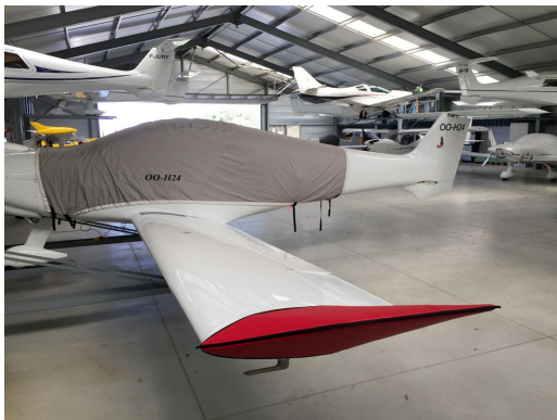
Dynaero MCR.4 Pickup Canopy Cover, Wingtip Pads

Designed to prevent damage to the aircraft extremities in crowded hangars, these products are made of bright red Naugahyde and thickly padded with a sandwich of closed cell foam.