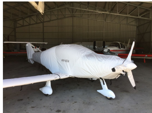
Dynaero MCR.4 Pickup Complete Cover Set.