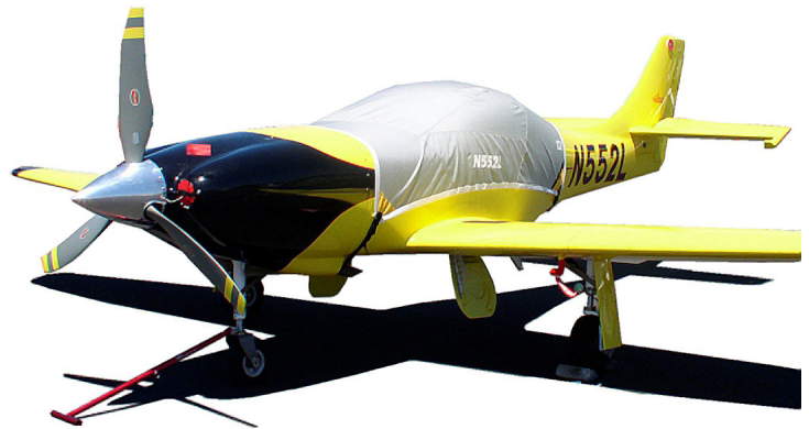
Canopy Cover for Lancair Legacy