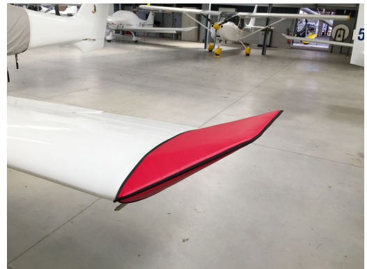
Dynaero MCR Pickup Wingtip Pads