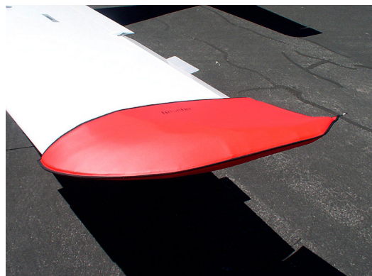
Cessna 350/400 Wingtip Pads