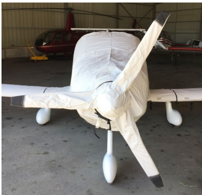
Dynaero MCR.4 Pickup Complete Cover Set.

This cover type is made from Silver Acrylic Sunbrella canvas and is 100% lined with a soft and smooth microfiber. Bruce's Custom Covers developed this material combination especially for aircraft protection. The outer material is medium weight and treated for water resistance, UV resistance and anti-static buildup. The inner lining is a very soft and smooth microfiber to prevent scratching. The material is very reflective, and tests show that the cabin interior temperature can be reduced to near-ambient temperature on the hottest of days. It is water, ice and snow repellent, yet breathable to allow moisture to escape from between the cover and the aircraft surface.