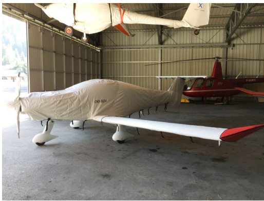
Dynaero MCR.4 Pickup Complete Cover Set.

This cover type is made from Silver Acrylic Sunbrella canvas and is 100% lined with a soft and smooth microfiber. Bruce's Custom Covers developed this material combination especially for aircraft protection. The outer material is medium weight and treated for water resistance, UV resistance and anti-static buildup. The inner lining is a very soft and smooth microfiber to prevent scratching. The material is very reflective, and tests show that the cabin interior temperature can be reduced to near-ambient temperature on the hottest of days. It is water, ice and snow repellent, yet breathable to allow moisture to escape from between the cover and the aircraft surface.