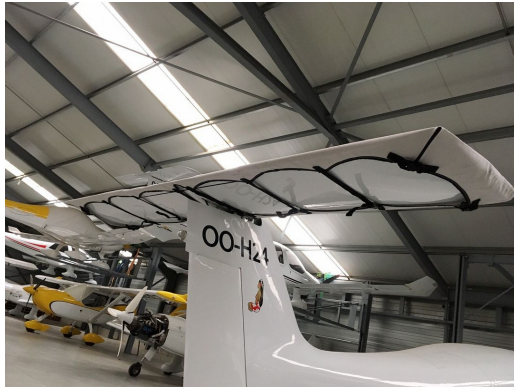
Dynaero MCR Horizontal Stabilizer Cover

WINTER USE MATERIAL - Made with Solution-Dyed Polyester fabric, this option is intended for seasonal use to aid in deicing, rain mitigation, or for occasional travel. The material is lighter and more compact, but more susceptible to UV damage and may have a shorter useful life if used continuously outside than the all-year use material.