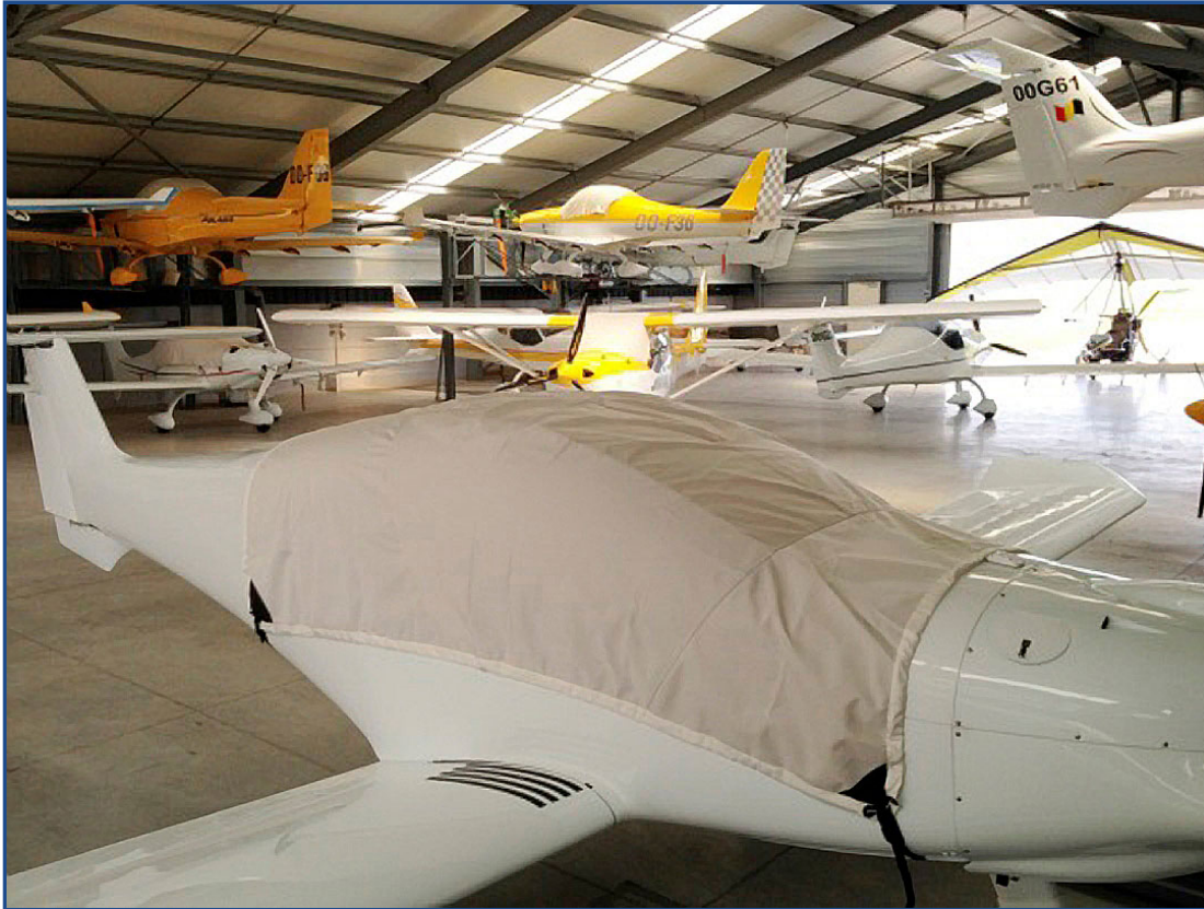
Dynaero MCR Pickup Canopy Cover