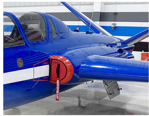
Fouga Magister CM170 Intake Plugs