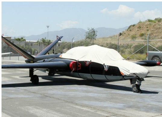
Fougua Magister Canopy/Nose Cover with nose mount loop antenna

This cover type is made from Silver Acrylic Sunbrella canvas and is 100% lined with a soft and smooth microfiber. Bruce's Custom Covers developed this material combination especially for aircraft protection. The outer material is medium weight and treated for water resistance, UV resistance and anti-static buildup. The inner lining is a very soft and smooth microfiber to prevent scratching. The material is very reflective, and tests show that the cabin interior temperature can be reduced to near-ambient temperature on the hottest of days. It is water, ice and snow repellent, yet breathable to allow moisture to escape from between the cover and the aircraft surface.