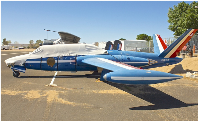
Fouga Magister Canopy/Nose Cover

Travel Covers are made with Silver Solution-Dyed Polyester fabric and only lined over the windshield to save weight. The material is lightweight and more compact for easy stowage in the aircraft. The polyester material is water resistant, but only intended for occasional use outside. We also have an ultra lightweight material available for fitted hangar dust covers. For daily outdoor use, the non-travel Sunbrella Cover is the best choice.