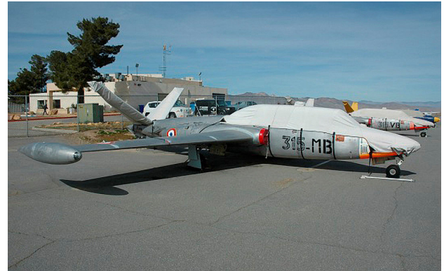
Fouga Magister Canopy/Nose Cover & Tail Stabilizer Covers