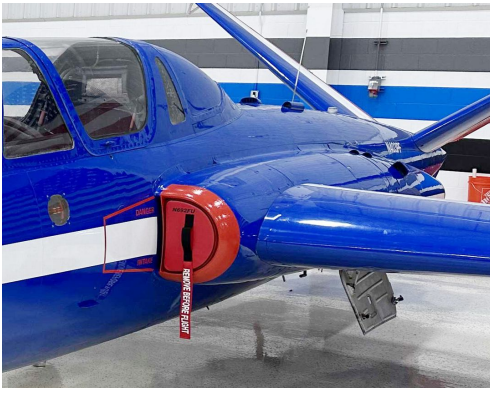
Fouga Magister CM170 Intake Plugs