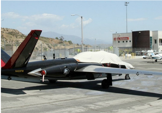
Fouga Magister Canopy/Nose Cover with nose mount loop antenna

This cover type is made from Silver Acrylic Sunbrella canvas and is 100% lined with a soft and smooth microfiber. Bruce's Custom Covers developed this material combination especially for aircraft protection. The outer material is medium weight and treated for water resistance, UV resistance and anti-static buildup. The inner lining is a very soft and smooth microfiber to prevent scratching. The material is very reflective, and tests show that the cabin interior temperature can be reduced to near-ambient temperature on the hottest of days. It is water, ice and snow repellent, yet breathable to allow moisture to escape from between the cover and the aircraft surface.