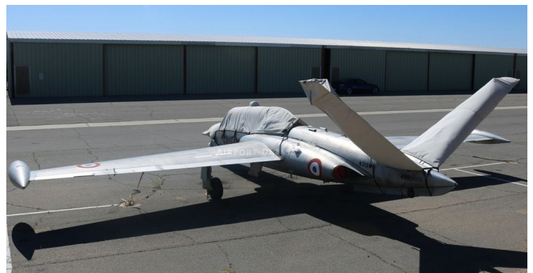
Fouga Magister Canopy/Nose Cover, Tail Stabilizer Covers