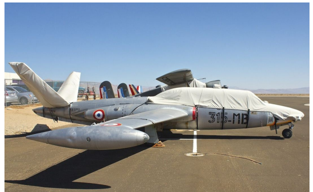
Fouga Magister Canopy/Nose Cover, Tail Stabilizer Covers