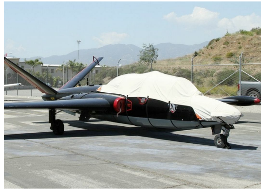
Fouga Magister Canopy/Nose Cover with nose mount loop antenna