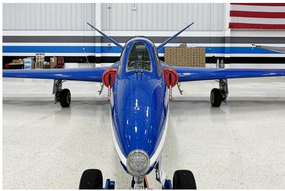
Fouga Magister CM170 Intake Plugs