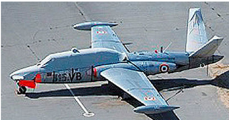
Fouga Magister Canopy/Nose & Stabilizer Covers

WINTER USE MATERIAL - Made with Solution-Dyed Polyester fabric, this option is intended for seasonal use to aid in deicing, rain mitigation, or for occasional travel. The material is lighter and more compact, but more susceptible to UV damage and may have a shorter useful life if used continuously outside than the all-year use material.