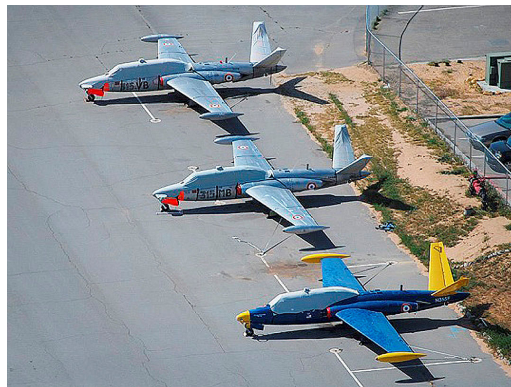
Fougua Magister Canopy Cover, Canopy/Nose Covers and Tail Stabilizer Covers