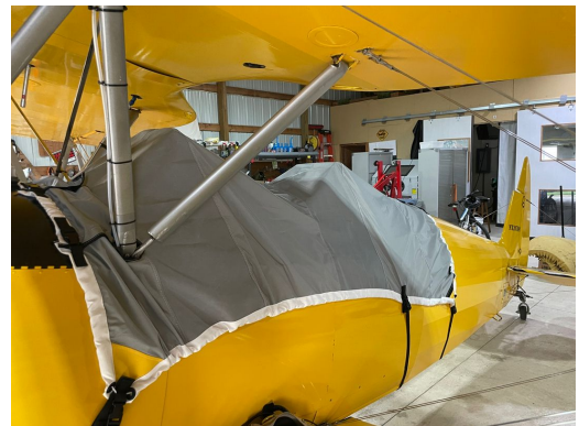
Marquardt Charger Travel Weight Canopy Cover