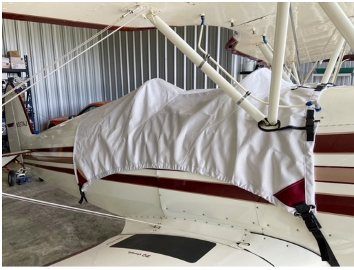
Marquardt Charger Cockpit Cover