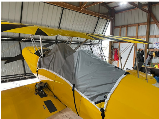
Marquardt Charger Travel Weight Canopy Cover

This cover type is made from Silver Acrylic Sunbrella canvas and is 100% lined with a soft and smooth microfiber. Bruce's Custom Covers developed this material combination especially for aircraft protection. The outer material is medium weight and treated for water resistance, UV resistance and anti-static buildup. The inner lining is a very soft and smooth microfiber to prevent scratching. The material is very reflective, and tests show that the cabin interior temperature can be reduced to near-ambient temperature on the hottest of days. It is water, ice and snow repellent, yet breathable to allow moisture to escape from between the cover and the aircraft surface.