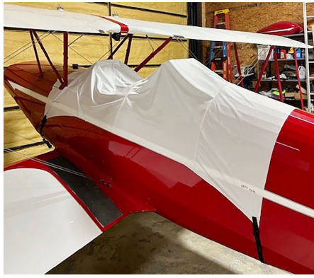
Marquardt Charger MA-5 Cockpit Cover