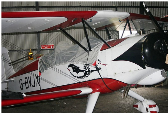
Marquardt Charger MA-5 Light Weight Travel Cockpit Cover

This cover type is made from Silver Acrylic Sunbrella canvas and is 100% lined with a soft and smooth microfiber. Bruce's Custom Covers developed this material combination especially for aircraft protection. The outer material is medium weight and treated for water resistance, UV resistance and anti-static buildup. The inner lining is a very soft and smooth microfiber to prevent scratching. The material is very reflective, and tests show that the cabin interior temperature can be reduced to near-ambient temperature on the hottest of days. It is water, ice and snow repellent, yet breathable to allow moisture to escape from between the cover and the aircraft surface.