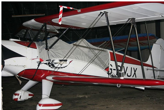
Marquardt Charger MA-5 Light Weight Travel Cockpit Cover

This cover type is made from Silver Acrylic Sunbrella canvas and is 100% lined with a soft and smooth microfiber. Bruce's Custom Covers developed this material combination especially for aircraft protection. The outer material is medium weight and treated for water resistance, UV resistance and anti-static buildup. The inner lining is a very soft and smooth microfiber to prevent scratching. The material is very reflective, and tests show that the cabin interior temperature can be reduced to near-ambient temperature on the hottest of days. It is water, ice and snow repellent, yet breathable to allow moisture to escape from between the cover and the aircraft surface.