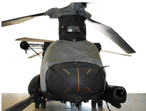
Boeing Vertol CH-47 Forward Cabin & Rotor Hub Cover

Insulated Covers Material - A special composite material of solution-dyed polyester, 3M Thinsulate insulation, and soft nylon interior fabric. Our insulated covers are designed to complement an engine preheater and help retain heat in the engine compartment after shutdown. If you operate your aircraft in cold-weather, these covers will help prevent engine wear and tear.