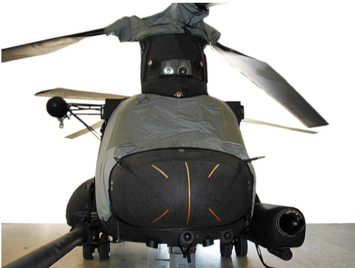
Boeing Vertol CH-47 Forward Cabin & Rotor Hub Cover

Insulated Covers Material - A special composite material of solution-dyed polyester, 3M Thinsulate insulation, and soft nylon interior fabric. Our insulated covers are designed to complement an engine preheater and help retain heat in the engine compartment after shutdown. If you operate your aircraft in cold-weather, these covers will help prevent engine wear and tear.