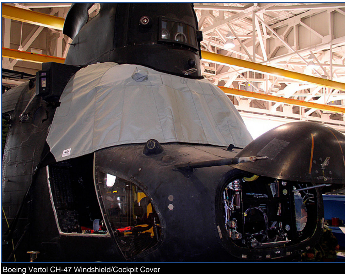
Boeing Vertol CH-47 Windshield/Cockpit Cover