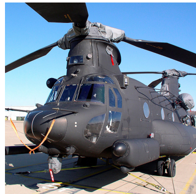
Boeing Vertol MH-47 Rotor Hubs, Engine & Other Covers