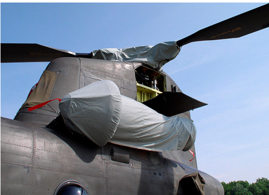
Boeing Vertol CH-47 Engine and Rotor Hub Covers

Insulated Covers Material - A special composite material of solution-dyed polyester, 3M Thinsulate insulation, and soft nylon interior fabric. Our insulated covers are designed to complement an engine preheater and help retain heat in the engine compartment after shutdown. If you operate your aircraft in cold-weather, these covers will help prevent engine wear and tear.