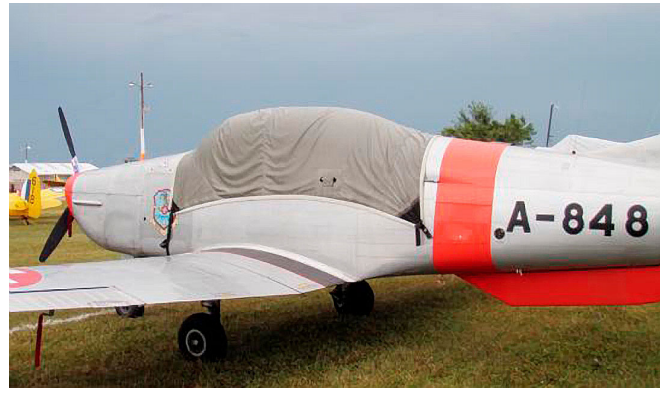
Pilatus P-3 Canopy Cover