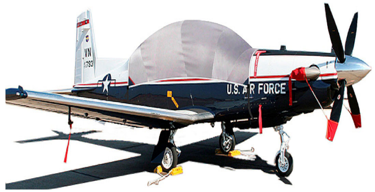
Texan II T6A Canopy Cover, Engine Inlet Plug, Prop Tie/Exhaust Covers, Pitot Cover