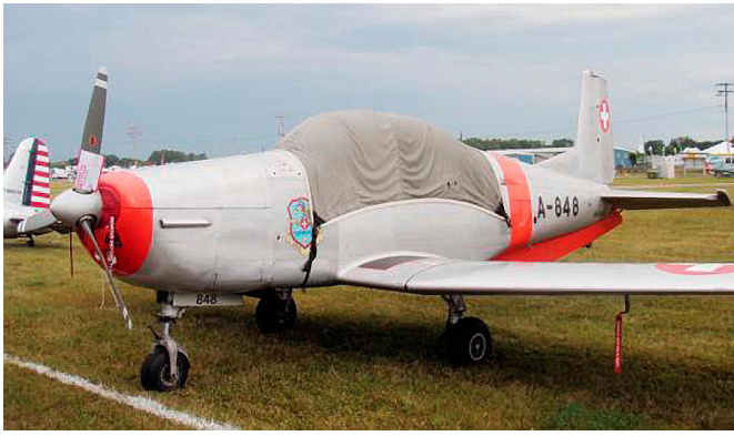
Pilatus P-3 Canopy Cover