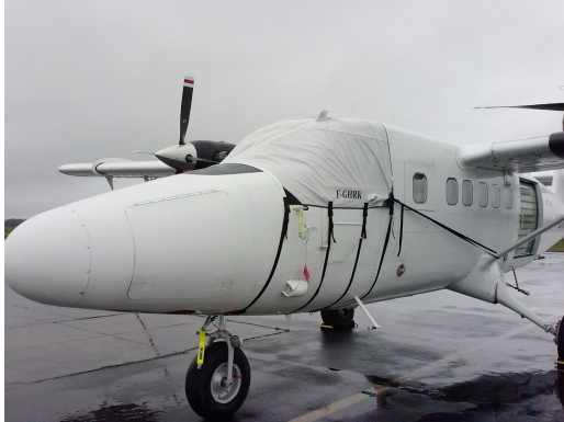
Twin Otter Cockpit Cover

This cover type is made from Silver Acrylic Sunbrella canvas and is 100% lined with a soft and smooth microfiber. Bruce's Custom Covers developed this material combination especially for aircraft protection. The outer material is medium weight and treated for water resistance, UV resistance and anti-static buildup. The inner lining is a very soft and smooth microfiber to prevent scratching. The material is very reflective, and tests show that the cabin interior temperature can be reduced to near-ambient temperature on the hottest of days. It is water, ice and snow repellent, yet breathable to allow moisture to escape from between the cover and the aircraft surface.