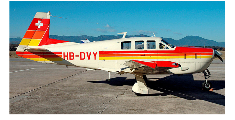
Mooney M20 Extended Canopy Cover