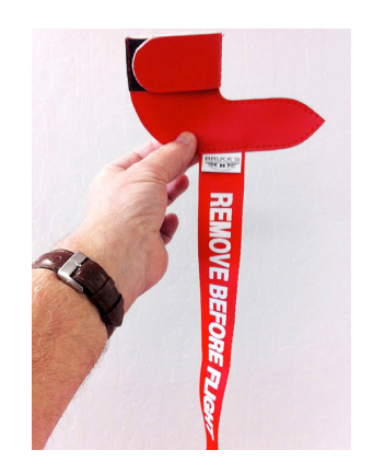
Standard Pitot Cover