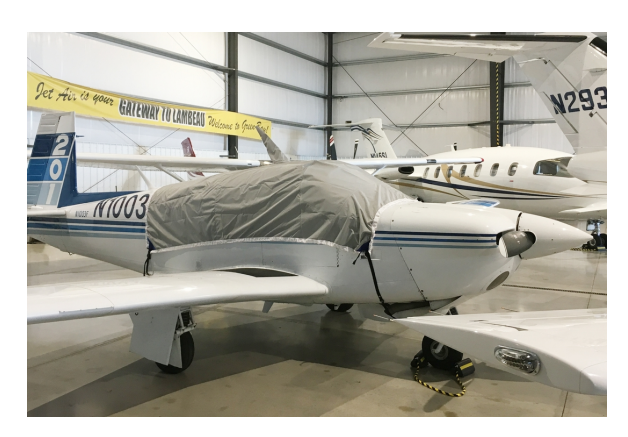
Mooney 201 Travel Cover, Light Weight Travel Canopy Cover, 5 Lbs

Travel Covers are made with Silver Solution-Dyed Polyester fabric and only lined over the windshield to save weight. The material is lightweight and more compact for easy stowage in the aircraft. The polyester material is water resistant, but only intended for occasional use outside. We also have an ultra lightweight material available for fitted hangar dust covers. For daily outdoor use, the non-travel Sunbrella Cover is the best choice.