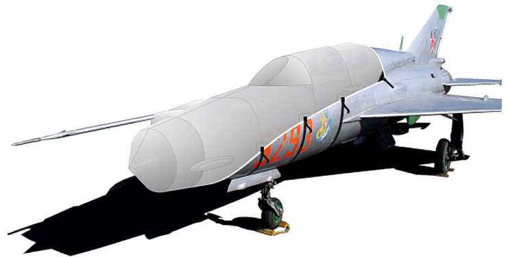
Mig 21 Canopy/Nose Cover