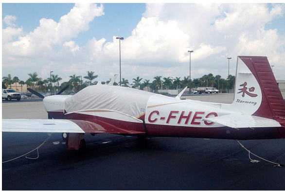
Mooney TLS Canopy Cover

This cover type is made from Silver Acrylic Sunbrella canvas and is 100% lined with a soft and smooth microfiber. Bruce's Custom Covers developed this material combination especially for aircraft protection. The outer material is medium weight and treated for water resistance, UV resistance and anti-static buildup. The inner lining is a very soft and smooth microfiber to prevent scratching. The material is very reflective, and tests show that the cabin interior temperature can be reduced to near-ambient temperature on the hottest of days. It is water, ice and snow repellent, yet breathable to allow moisture to escape from between the cover and the aircraft surface.