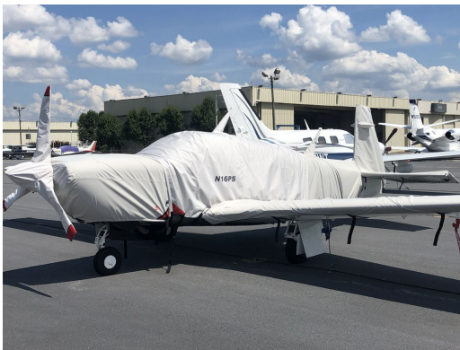
Mooney M20TN Acclaim Full Cover Set

This cover type is made from Silver Acrylic Sunbrella canvas and is 100% lined with a soft and smooth microfiber. Bruce's Custom Covers developed this material combination especially for aircraft protection. The outer material is medium weight and treated for water resistance, UV resistance and anti-static buildup. The inner lining is a very soft and smooth microfiber to prevent scratching. The material is very reflective, and tests show that the cabin interior temperature can be reduced to near-ambient temperature on the hottest of days. It is water, ice and snow repellent, yet breathable to allow moisture to escape from between the cover and the aircraft surface.