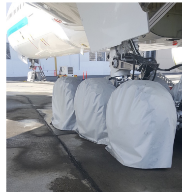
Boeing 777 Main & Nose Gear Tire Covers