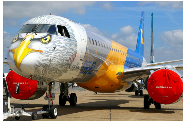
Embraer E195 Intake Covers