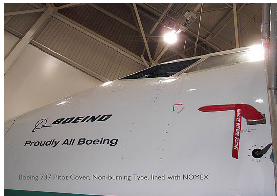
Boeing 737 Heat Resistant Pitot Cover

The Engine Inlet Plugs are custom fit for your Embraer EMB-190/195, Lineage 1000 intakes, made with heavy-duty vinyl material, and stuffed with a single block of sculpted urethane foam. Each plug has a zipper that allows the foam to be removed and dried if necessary. Engine plugs have 'remove before flight' streamers sewn onto the face of the plugs. Most plugs are imprinted with the aircraft registration number in black for an extra charge. Storage bag NOT included. Engine plugs may be inserted after flight when the engine is still warm. Engine Inlet Plugs are commonly referred to as Cowl Plugs, Intake Plugs, Cowl Blocks, Engine Blocks, and Engine Bungs.