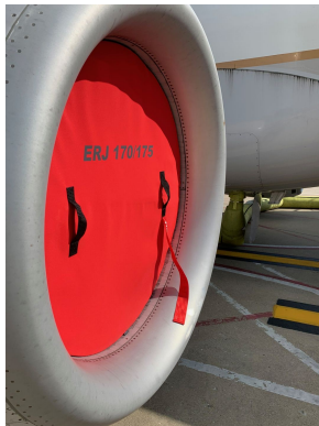
Embraer EMB-170/175 Engine Inlet Plugs

The Engine Inlet Plugs are custom fit for your Embraer EMB-170/175 intakes, made with heavy-duty vinyl material, and stuffed with a single block of sculpted urethane foam. Each plug has a zipper that allows the foam to be removed and dried if necessary. Engine plugs have 'remove before flight' streamers sewn onto the face of the plugs. Most plugs are imprinted with the aircraft registration number in black for an extra charge. Storage bag NOT included. Engine plugs may be inserted after flight when the engine is still warm. Engine Inlet Plugs are commonly referred to as Cowl Plugs, Intake Plugs, Cowl Blocks, Engine Blocks, and Engine Bungs.