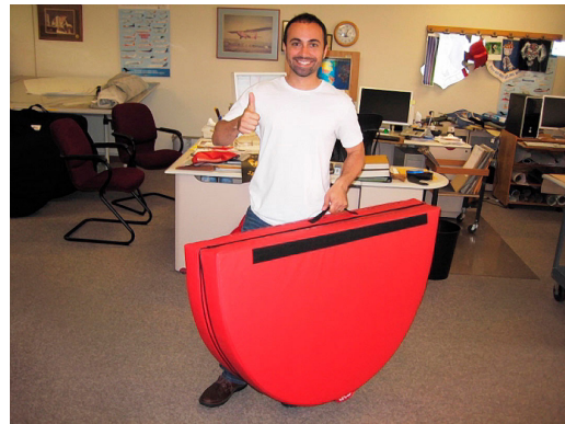
Boeing 737 FOD protection Intake Plug, folding type