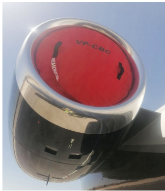
Embraer ERJ-135/140/145 Legacy 600, 650, Praetor Intake/Exhaust Plugs, Non-Folding Type

The Engine Inlet Plugs are custom fit for your Embraer ERJ-135/140/145 Legacy 600, 650 intakes, made with heavy-duty vinyl material, and stuffed with a single block of sculpted urethane foam. Each plug has a zipper that allows the foam to be removed and dried if necessary. Engine plugs have 'remove before flight' streamers sewn onto the face of the plugs. Most plugs are imprinted with the aircraft registration number in black for an extra charge. Storage bag NOT included. Engine plugs may be inserted after flight when the engine is still warm. Engine Inlet Plugs are commonly referred to as Cowl Plugs, Intake Plugs, Cowl Blocks, Engine Blocks, and Engine Bungs.