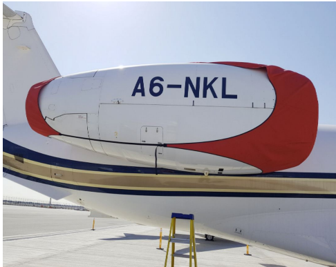
Embraer ERJ-135/140/145 Legacy 650 3-Strap Intake/Exhaust Cover

The Embraer ERJ-135/140/145 Legacy 600, 650 Intake Covers are designed to install easily yet be completely storable. A spring steel hoop is sewn into the hem of each cover, allowing them to be installed without climbing onto the wing or using a stepladder. To store the covers the spring steel hoop folds like a band-saw blade into three nesting rings. Each cover folds into a compact circular bundle which is stored in the included duffle bag, yet they unfold quickly for use. The Tri-Fold Ring cover is made of medium weight nylon which is available in a variety of colors to match the paint trim. Each cover set comes complete with installation and folding instructions. The aircraft's registration number can be silkscreened onto the cover for an extra charge.