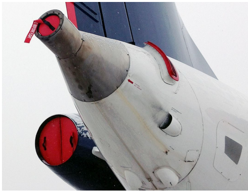
Embraer Legacy 650 APU and Engine Exhaust Plugs

The Engine Inlet Plugs are custom fit for your Embraer ERJ-135/140/145 Legacy 600, 650 intakes, made with heavy-duty vinyl material, and stuffed with a single block of sculpted urethane foam. Each plug has a zipper that allows the foam to be removed and dried if necessary. Engine plugs have 'remove before flight' streamers sewn onto the face of the plugs. Most plugs are imprinted with the aircraft registration number in black for an extra charge. Storage bag NOT included. Engine plugs may be inserted after flight when the engine is still warm. Engine Inlet Plugs are commonly referred to as Cowl Plugs, Intake Plugs, Cowl Blocks, Engine Blocks, and Engine Bungs.