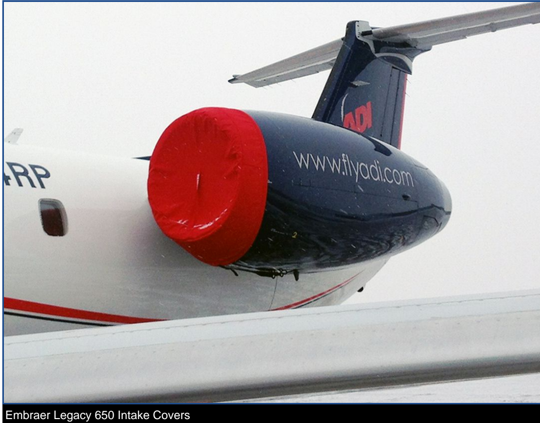
Embraer Legacy 650 Intake Covers