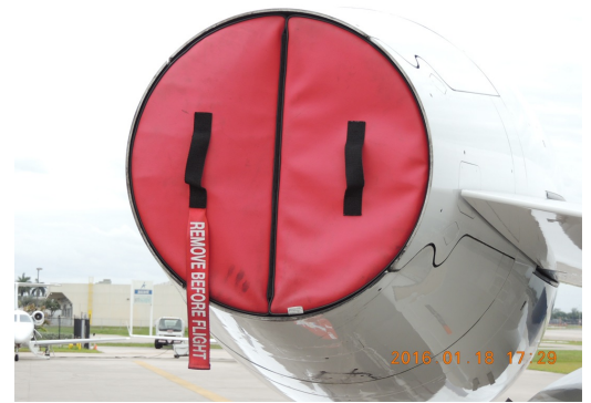
Embraer Legacy 500 Engine Exhaust Plug, folding type