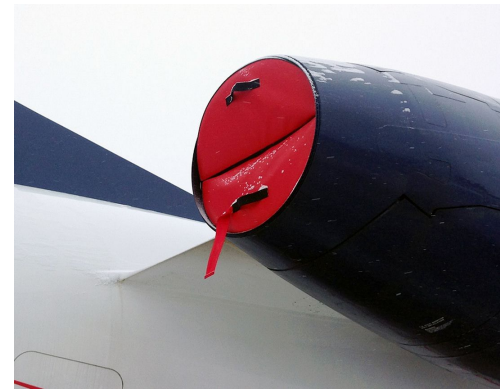
Embraer Legacy 650 Exhaust Plug