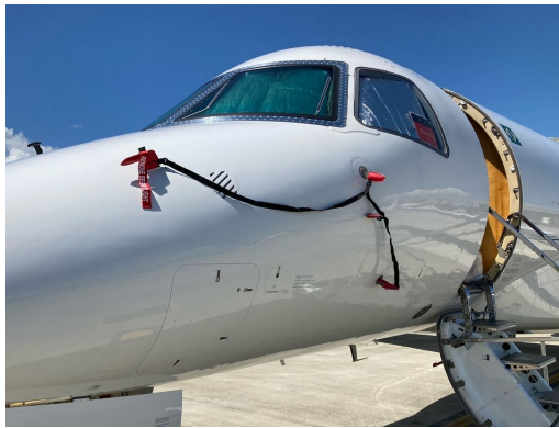
Embraer ERJ-135 Pitot/TAT/Ice Detector Covers

The Engine Inlet Plugs are custom fit for your Embraer ERJ-135/140/145 Legacy 600, 650 intakes, made with heavy-duty vinyl material, and stuffed with a single block of sculpted urethane foam. Each plug has a zipper that allows the foam to be removed and dried if necessary. Engine plugs have 'remove before flight' streamers sewn onto the face of the plugs. Most plugs are imprinted with the aircraft registration number in black for an extra charge. Storage bag NOT included. Engine plugs may be inserted after flight when the engine is still warm. Engine Inlet Plugs are commonly referred to as Cowl Plugs, Intake Plugs, Cowl Blocks, Engine Blocks, and Engine Bungs.