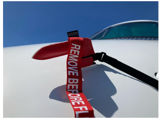
Embraer ERJ-135 Pitot/TAT/Ice Detector Covers