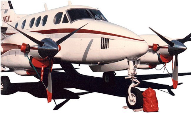
Pitot, Exhaust Covers, Engine Plugs & Prop Ties

Engine Inlet Plugs are custom fit for your Embraer Bandeirante EMB110 intakes, made with heavy-duty vinyl material, and stuffed with a single block of sculpted urethane foam. Each plug has a zipper that allows the foam to be removed and dried if necessary. Engine plugs have warning flags that are visible from the cockpit or 'remove before flight' streamers sewn onto the face of the plugs. Most plugs are imprinted with the aircraft registration number in black for an extra charge. Storage bag NOT included. Engine plugs may be inserted after flight when the engine is still warm. Engine Inlet Plugs are commonly referred to as Cowl Plugs, Intake Plugs, Cowl Blocks, Engine Blocks, and Engine Bungs.