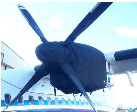
ATR-72-202 Insulated Engine & Prop Hub Covers

This cover type is made from Silver Acrylic Sunbrella canvas and is 100% lined with a soft and smooth microfiber. Bruce's Custom Covers developed this material combination especially for aircraft protection. The outer material is medium weight and treated for water resistance, UV resistance and anti-static buildup. The inner lining is a very soft and smooth microfiber to prevent scratching. The material is very reflective, and tests show that the cabin interior temperature can be reduced to near-ambient temperature on the hottest of days. It is water, ice and snow repellent, yet breathable to allow moisture to escape from between the cover and the aircraft surface.