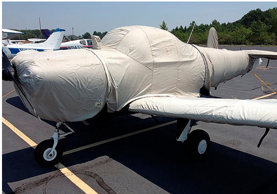
Ercoupe full cover set: Extended Canopy, Engine, Wing & Empennage covers

WINTER USE MATERIAL - Made with Solution-Dyed Polyester fabric, this option is intended for seasonal use to aid in deicing, rain mitigation, or for occasional travel. The material is lighter and more compact, but more susceptible to UV damage and may have a shorter useful life if used continuously outside than the all-year use material.