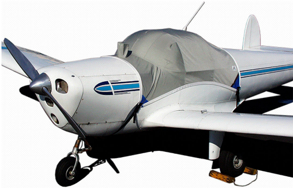
Ercoupe Canopy Cover, bubble windshield model

Travel Covers are made with Silver Solution-Dyed Polyester fabric and only lined over the windshield to save weight. The material is lightweight and more compact for easy stowage in the aircraft. The polyester material is water resistant, but only intended for occasional use outside. We also have an ultra lightweight material available for fitted hangar dust covers. For daily outdoor use, the non-travel Sunbrella Cover is the best choice.