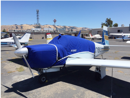
Mooney M20 Canopy & Engine Cover