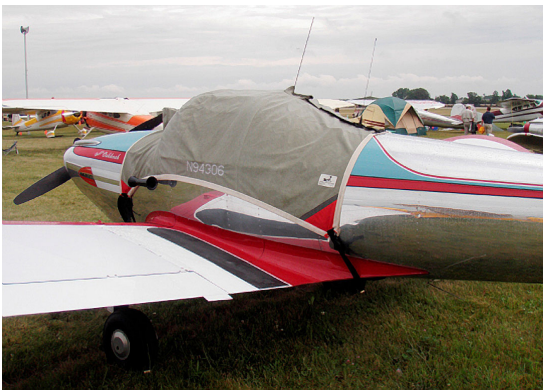
Ercoupe Canopy Cover, flat windshield model