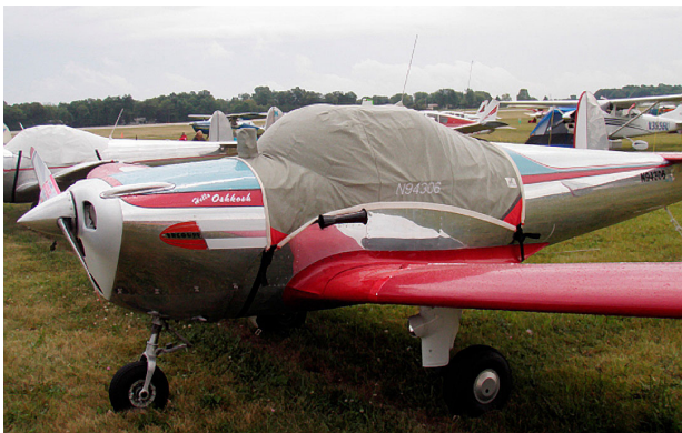
Ercoupe Canopy Cover, flat windshield model

the Canopy Cover and Engine Cover. This cover will enclose the engine cowl and will extend aft to cover all of the windows. This cover type is made from Silver Acrylic Sunbrella canvas and is 100% lined with a soft and smooth microfiber. Bruce's Custom Covers developed this material combination especially for aircraft protection. The outer material is medium weight and treated for water resistance, UV resistance and anti-static buildup. The inner lining is a very soft and smooth microfiber to prevent scratching. The material is very reflective, and tests show that the cabin interior temperature can be reduced to near-ambient temperature on the hottest of days. It is water, ice and snow repellent, yet breathable to allow moisture to escape from between the cover and the aircraft surface.