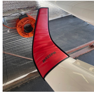
Stemme S-10 & S-12 Wingtip Pads