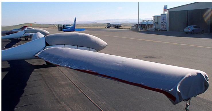
Sailplane Full Cover Set Graphic Indicators (Discus 2B, 3D model)