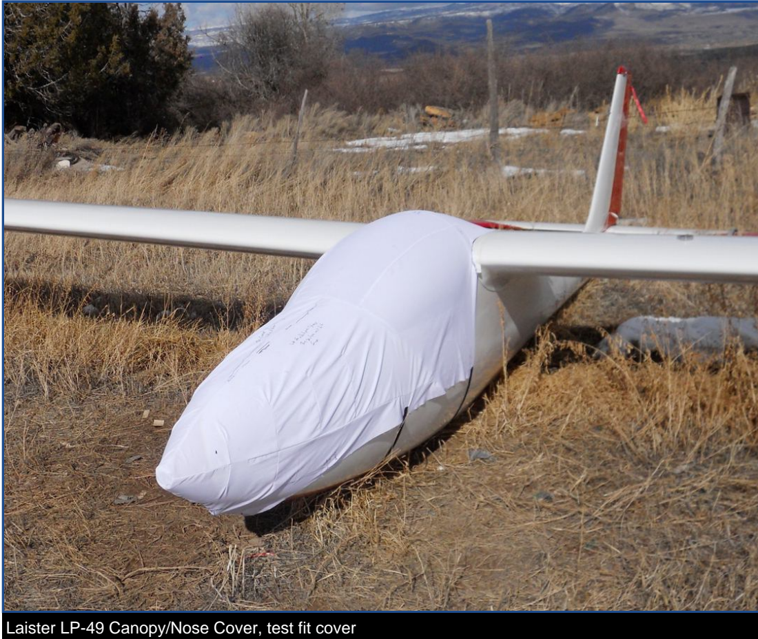
Laister LP-49 Canopy/Nose Cover, test fit cover