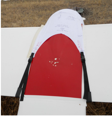
Laister LP-49 Canopy/Nose Cover, test fit cover

water resistance, UV resistance and anti-static buildup. The inner lining is a very soft and smooth microfiber to prevent scratching. The material is very reflective, and tests show that the cabin interior temperature can be reduced to near-ambient temperature on the hottest of days. It is water, ice and snow repellent, yet breathable to allow moisture to escape from between the cover and the aircraft surface.