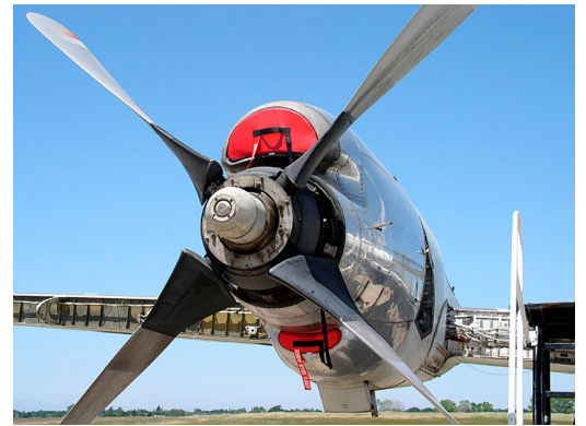
Lockheed P-3 Main Engine Inlet Plugs