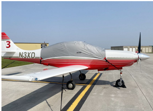
Lancair IV Travel Weight Canopy Cover

Travel Covers are made with Silver Solution-Dyed Polyester fabric and only lined over the windshield to save weight. The material is lightweight and more compact for easy stowage in the aircraft. The polyester material is water resistant, but only intended for occasional use outside. We also have an ultra lightweight material available for fitted hangar dust covers. For daily outdoor use, the non-travel Sunbrella Cover is the best choice.