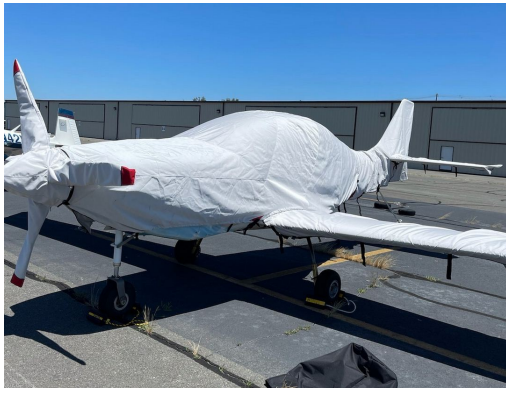
Lancair IV Complete Cover Set