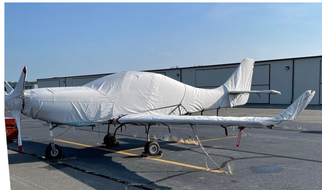
Lancair IV Complete Cover Set

This cover type is made from Silver Acrylic Sunbrella canvas and is 100% lined with a soft and smooth microfiber. Bruce's Custom Covers developed this material combination especially for aircraft protection. The outer material is medium weight and treated for water resistance, UV resistance and anti-static buildup. The inner lining is a very soft and smooth microfiber to prevent scratching. The material is very reflective, and tests show that the cabin interior temperature can be reduced to near-ambient temperature on the hottest of days. It is water, ice and snow repellent, yet breathable to allow moisture to escape from between the cover and the aircraft surface.