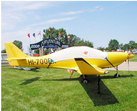
Lancair IV Canopy Cover

This cover type is made from Silver Acrylic Sunbrella canvas and is 100% lined with a soft and smooth microfiber. Bruce's Custom Covers developed this material combination especially for aircraft protection. The outer material is medium weight and treated for water resistance, UV resistance and anti-static buildup. The inner lining is a very soft and smooth microfiber to prevent scratching. The material is very reflective, and tests show that the cabin interior temperature can be reduced to near-ambient temperature on the hottest of days. It is water, ice and snow repellent, yet breathable to allow moisture to escape from between the cover and the aircraft surface.