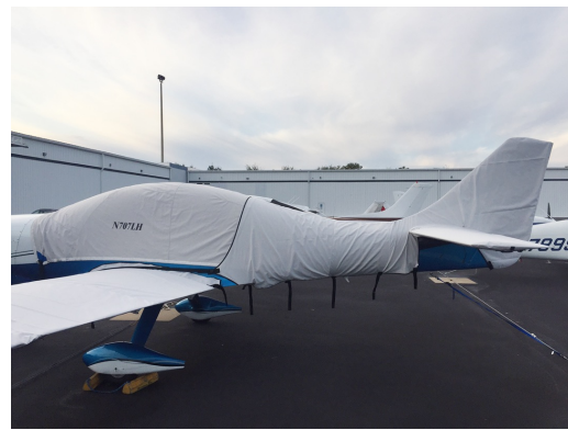
Lancair ES Wing Covers & Empennage Cover (sold separately)