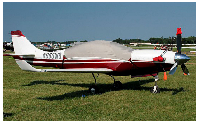
Lancair IV Canopy Cover & Prop Tie/Exhaust Cover