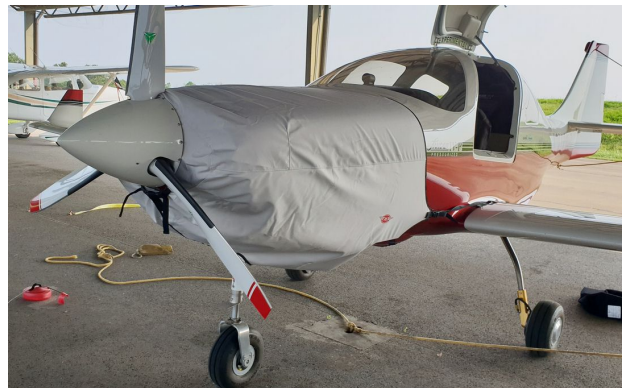
Lancair IV Engine Cover, Fully Enclosed