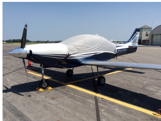
Lancair IV Light Weight Travel Canopy Cover