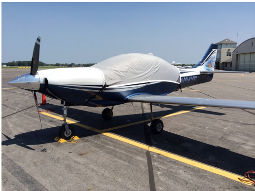
Lancair IV Light Weight Travel Canopy Cover