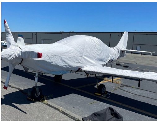
Lancair IV Complete Cover Set