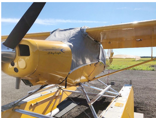
Sportsman 2+2 Wag Aero Light Weight Over the Top Travel Canopy Cover

Travel Covers are made with Silver Solution-Dyed Polyester fabric and only lined over the windshield to save weight. The material is lightweight and more compact for easy stowage in the aircraft. The polyester material is water resistant, but only intended for occasional use outside. We also have an ultra lightweight material available for fitted hangar dust covers. For daily outdoor use, the non-travel Sunbrella Cover is the best choice.