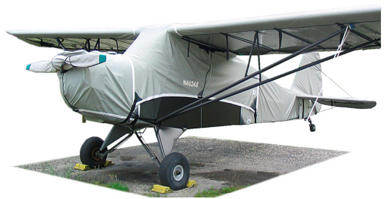
Piper PA-18 Super Cub Canopy Cover (Over-The-Top Style) Prop Cover, Engine Cover, Canopy Cover, Wing Covers and Empennage Cover