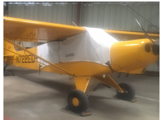
Taylorcraft L-2 Grasshopper Prop, Engine, Canopy, Wing and Empennage Covers Legend AL18 Canopy Cover, Over Top Type