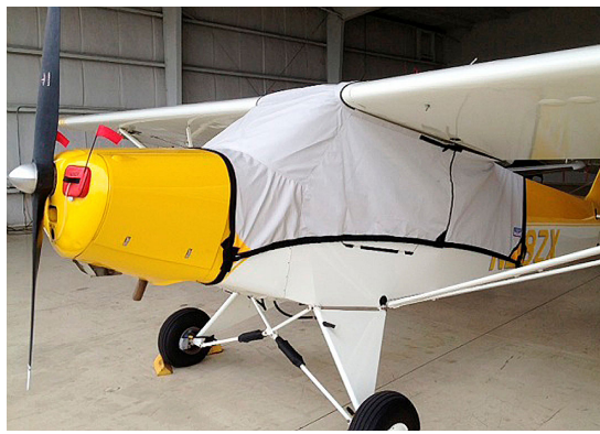
Legend Cub Over-Top Canopy Cover and Engine Plugs