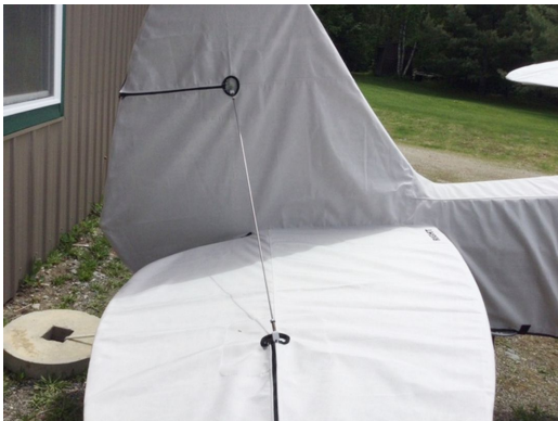
Piper PA-18-150 Super Cub Complete Cover Set

WINTER USE MATERIAL - Made with Solution-Dyed Polyester fabric, this option is intended for seasonal use to aid in deicing, rain mitigation, or for occasional travel. The material is lighter and more compact, but more susceptible to UV damage and may have a shorter useful life if used continuously outside than the all-year use material.