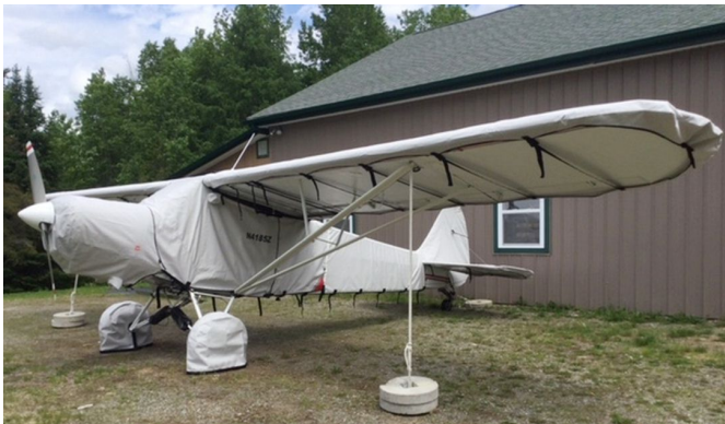
Piper PA-18-150 Super Cub Complete Cover Set