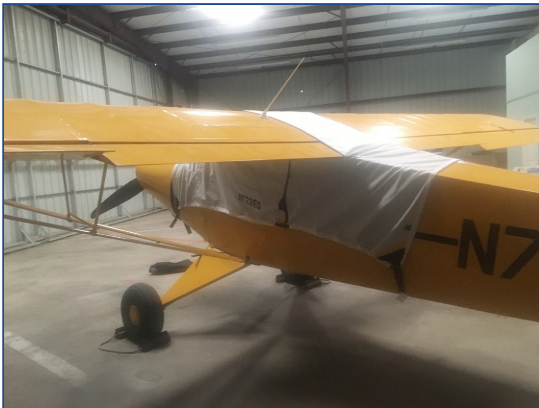
Legend AL18 Canopy Cover, Over Top Type