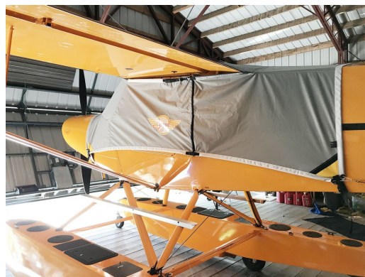
Legend Cub Light Weight Travel Cover